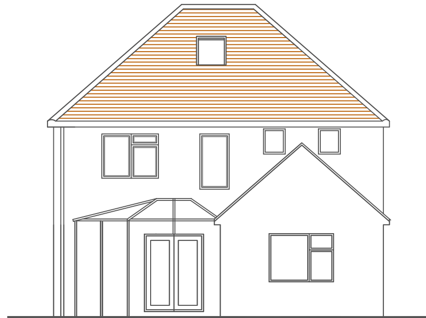
Rear Elevation (West)