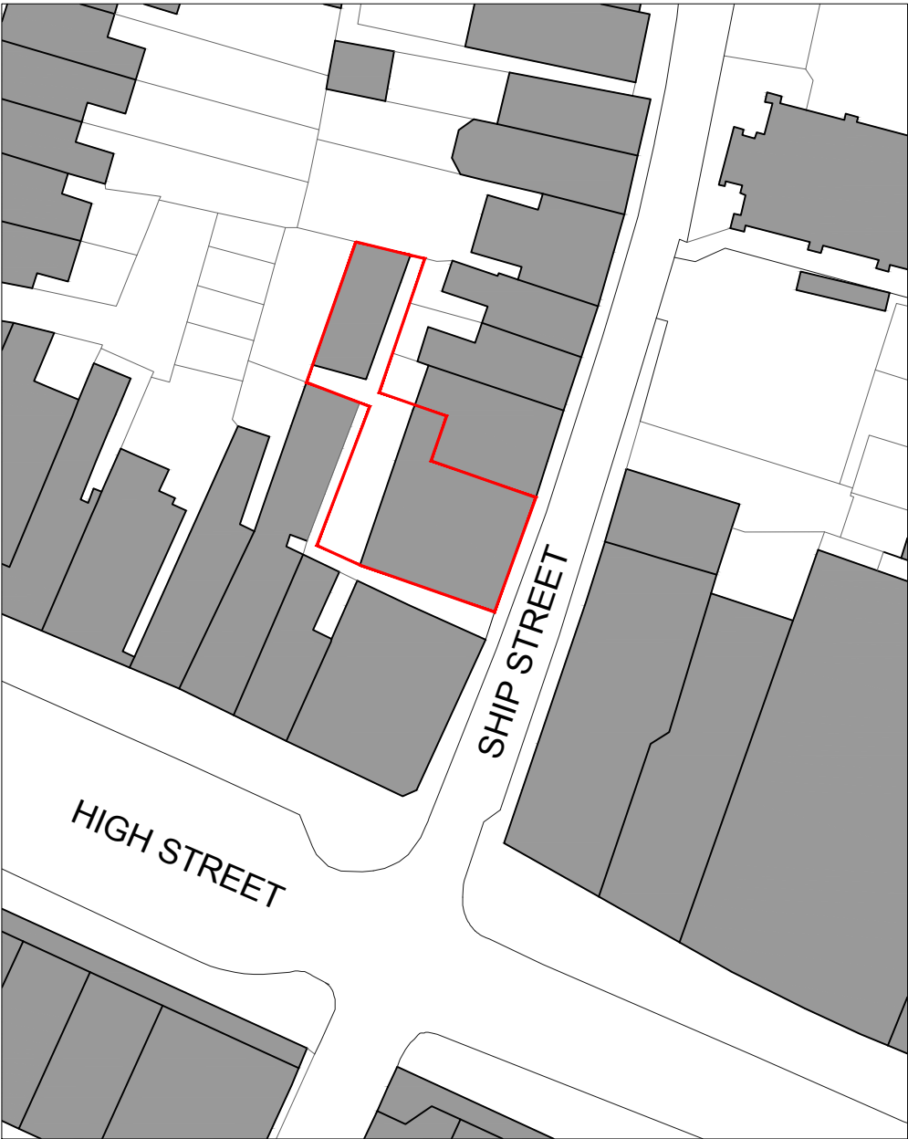
Existing Block Plan Scale: 1:500 [A3]