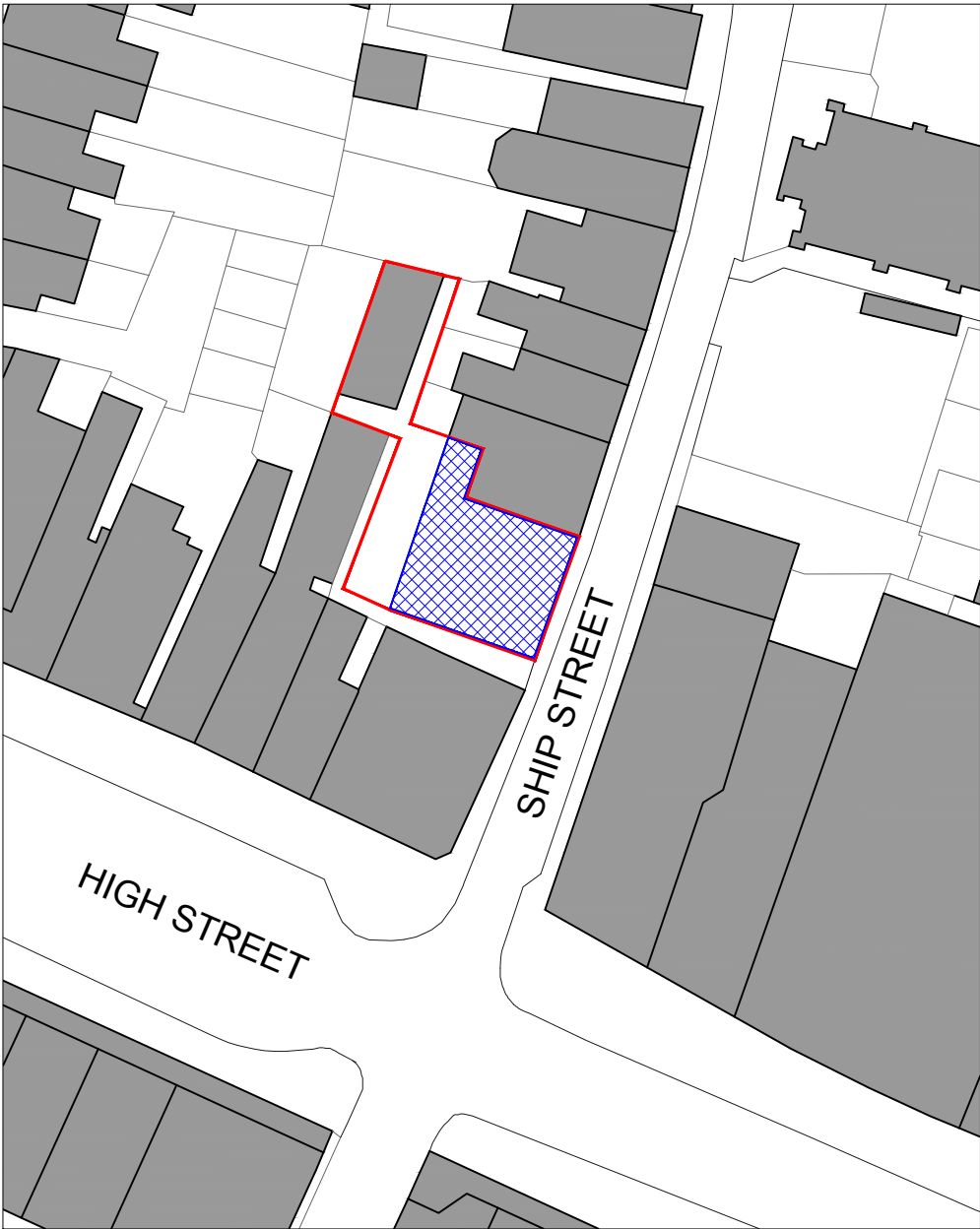
Proposed Block Plan Scale: 1:500 [A3]