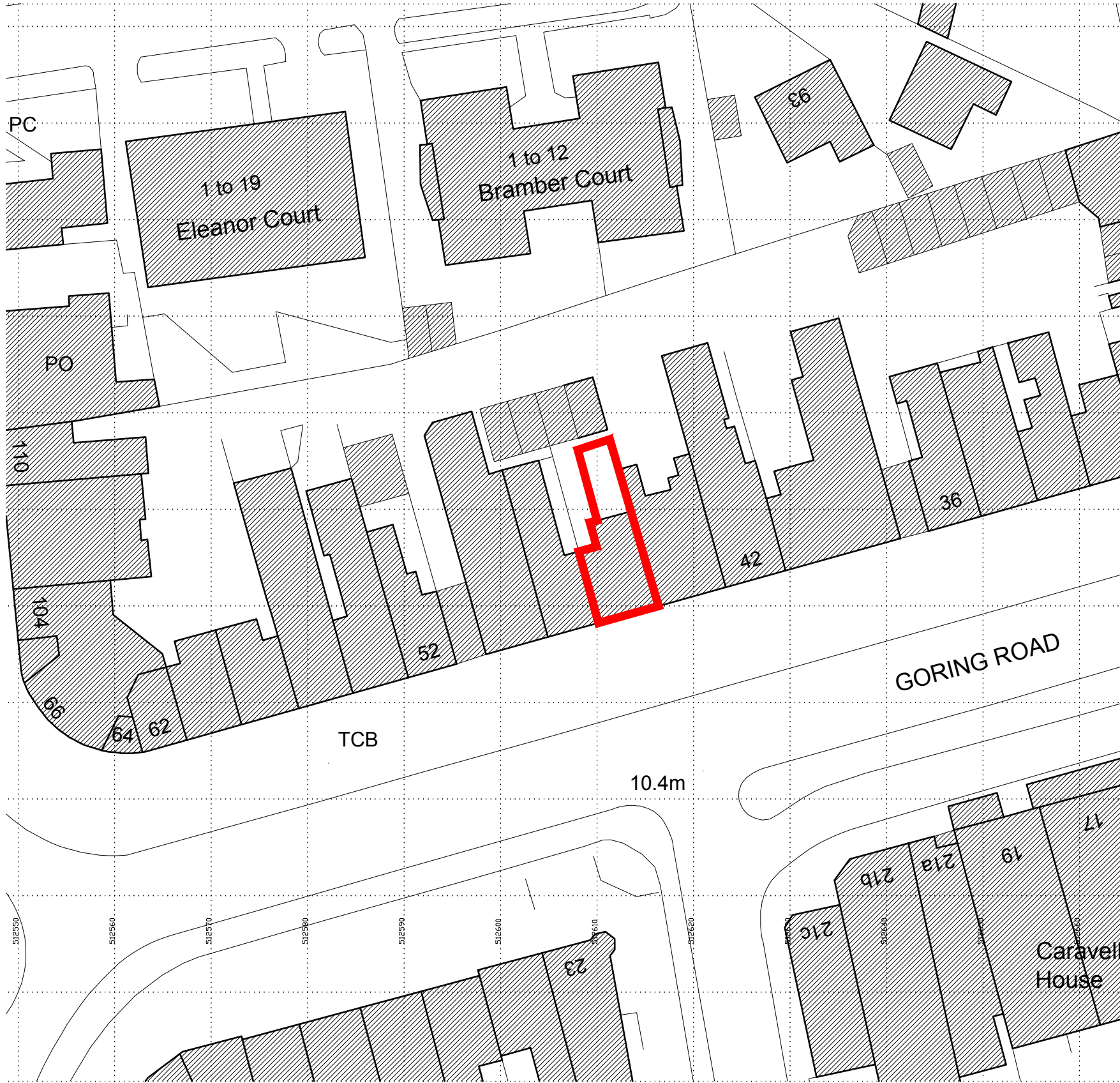
01 EXISTING & PROPOSED BLOCK PLAN 1001 Scale: 1:500