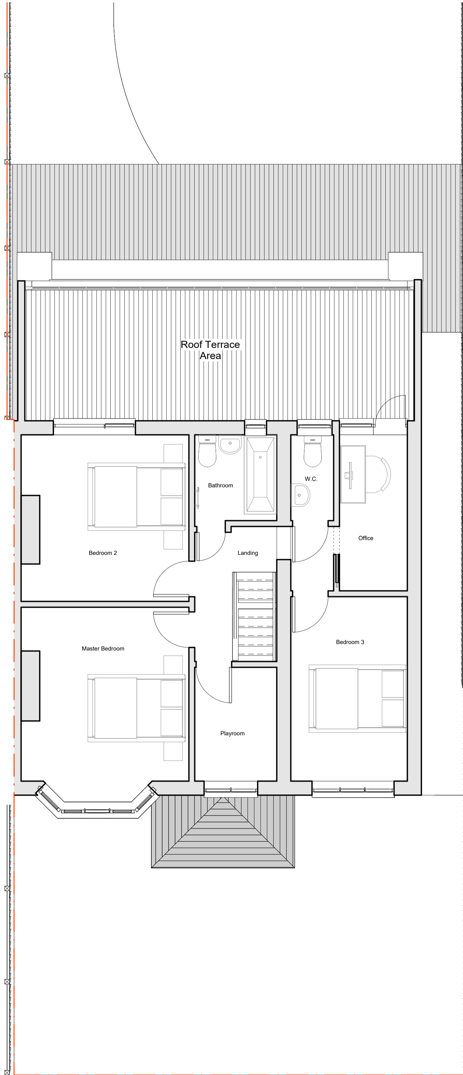
2 PRP FIRST FLOOR 2002 Scale: 1 : 50