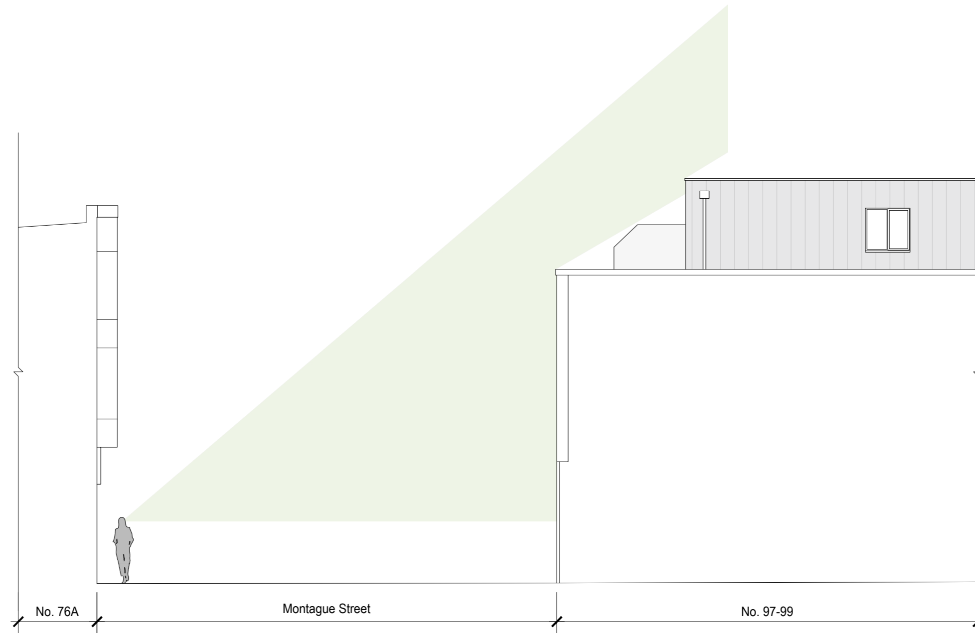
Proposed Street Section 1:100