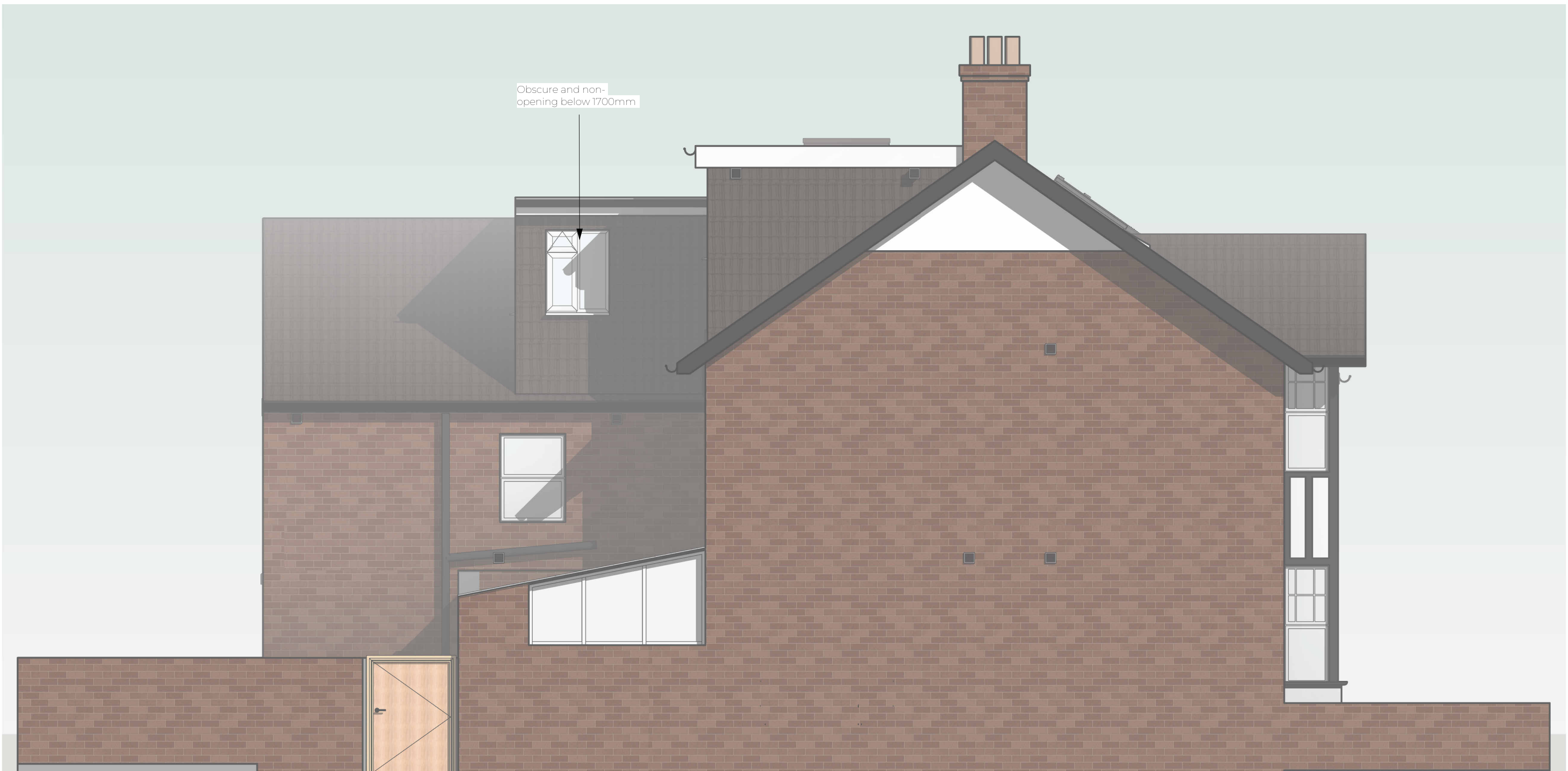
Proposed East Side Elevation 1 : 50