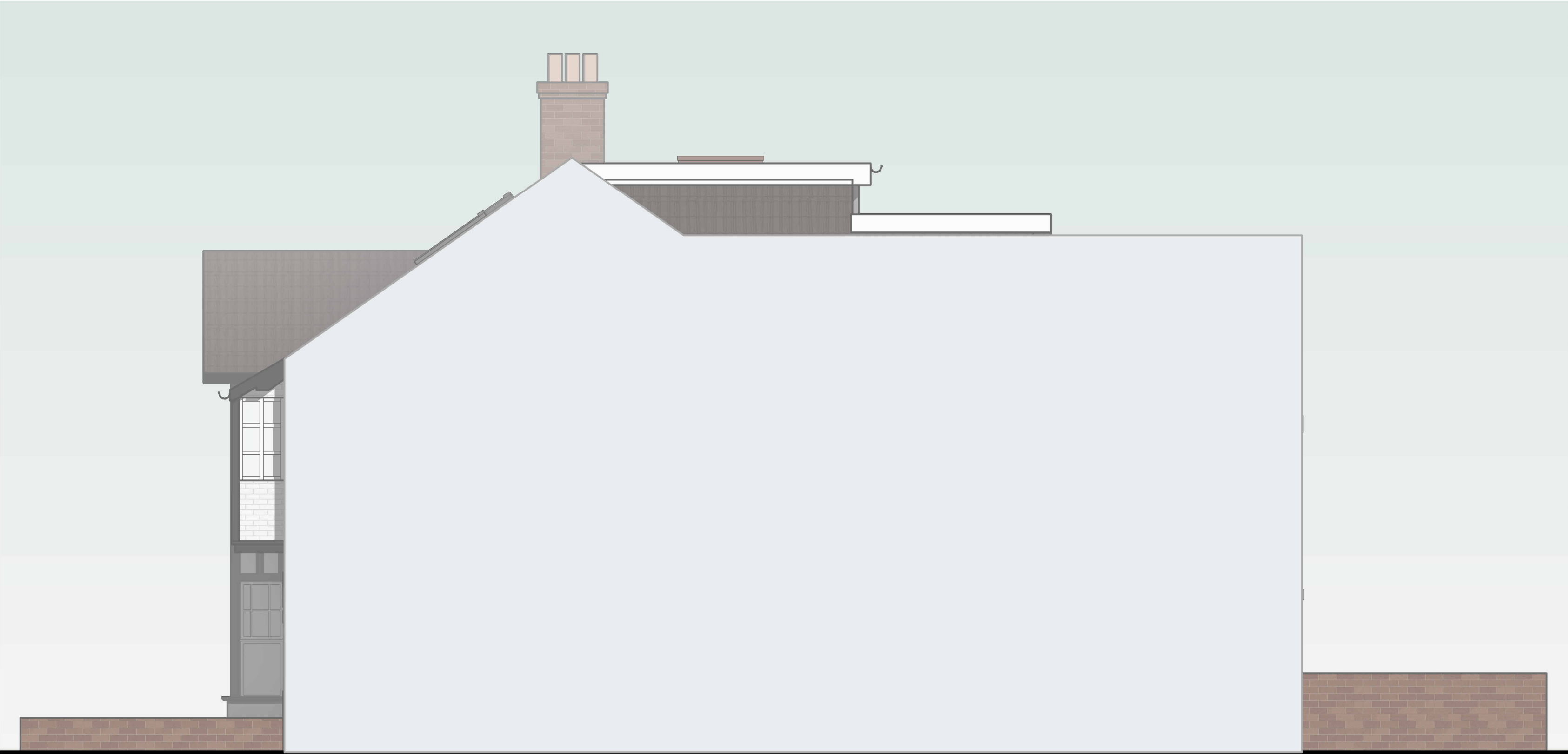
Proposed West Side Elevation 1 : 50