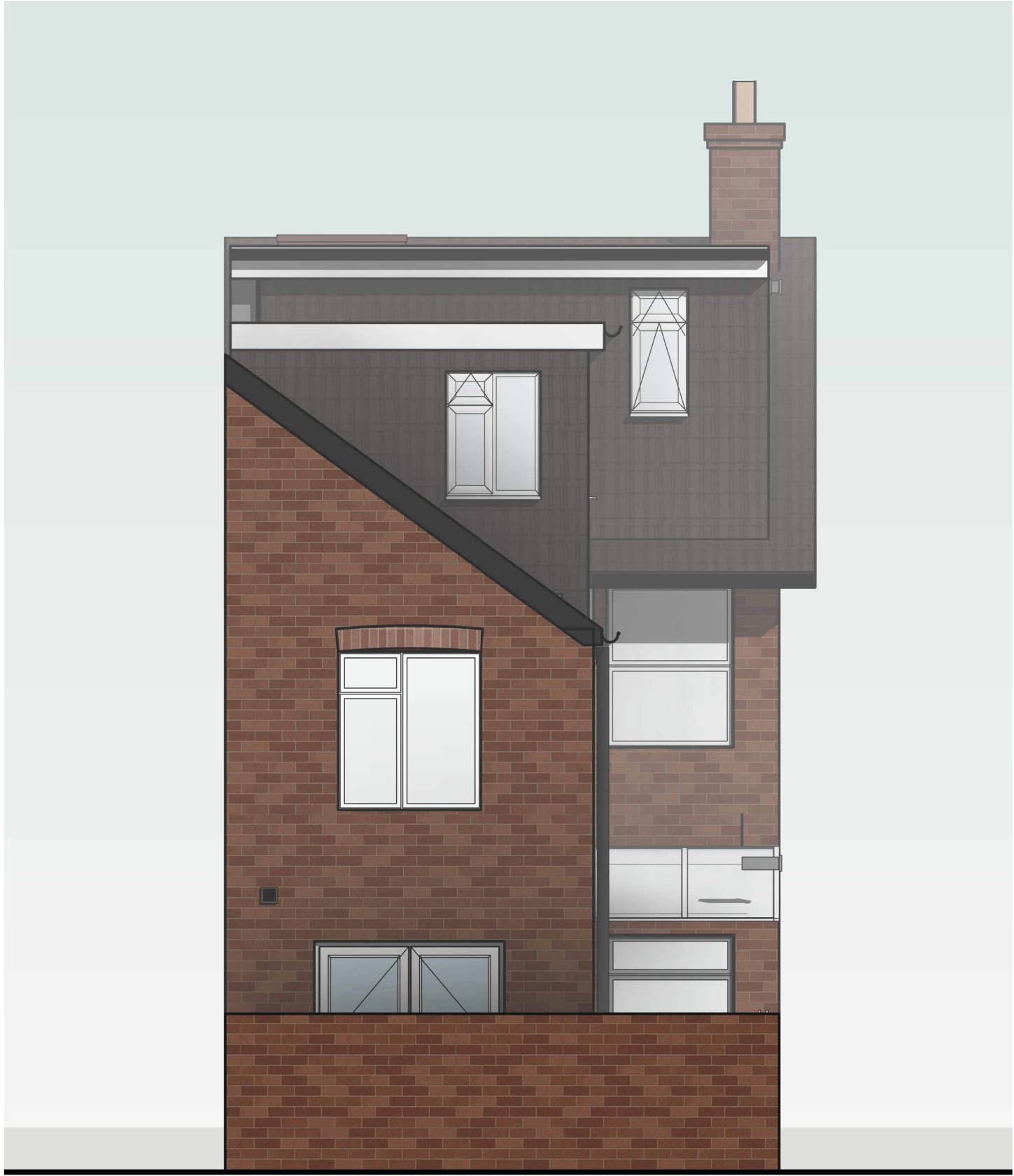
Proposed South Rear Elevation 1 : 50

0m 1m 2m 3m 4m 5m VISUAL SCALE 1:50 @ A1