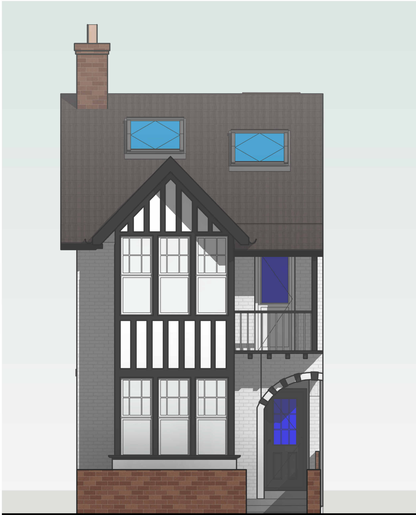
Proposed North Front Elevation 1 : 50