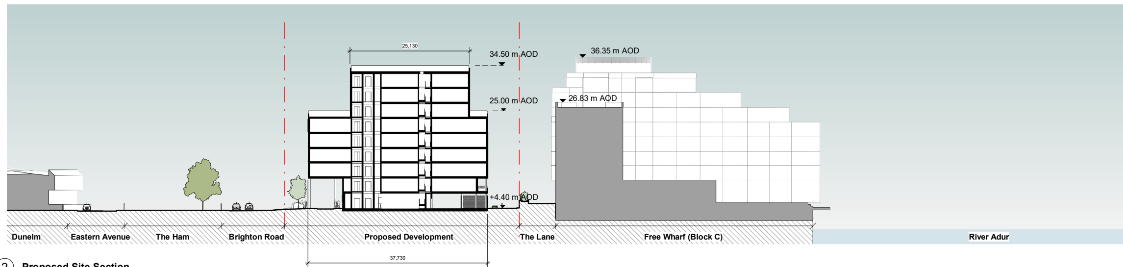
② Proposed Site Section 1 : 500