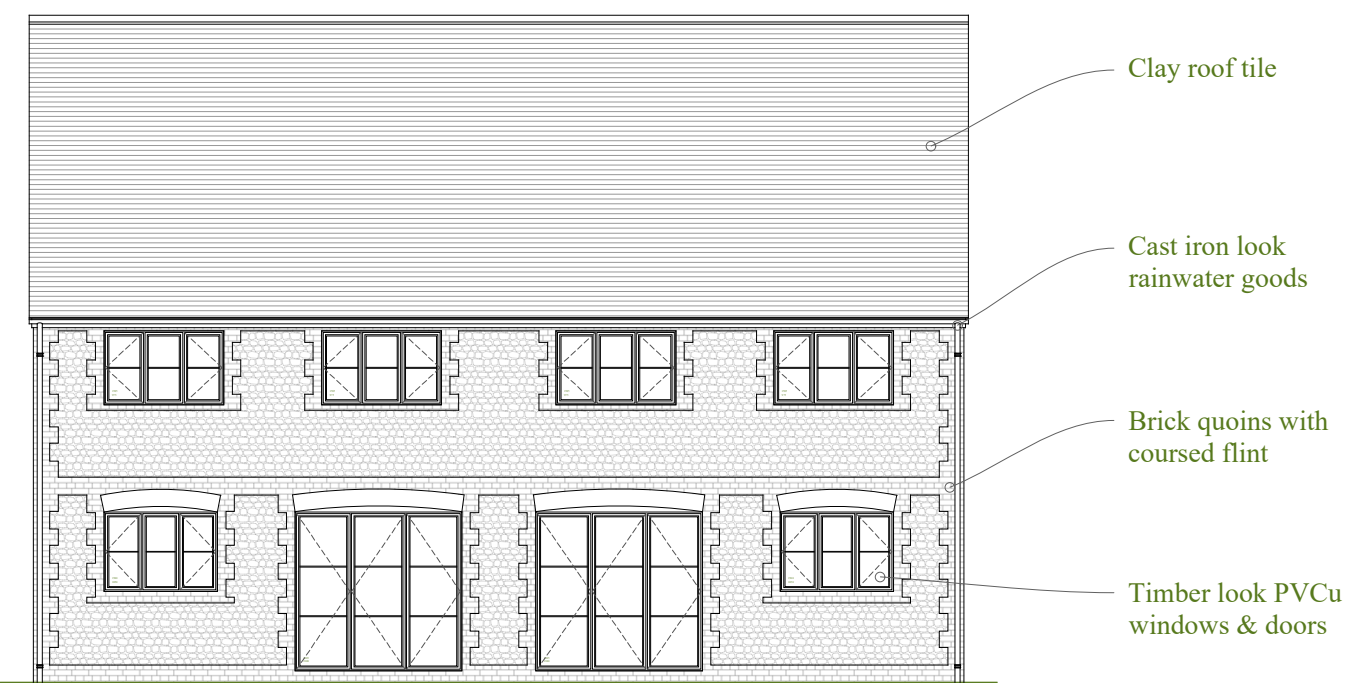
South 1:100 | PROPOSED