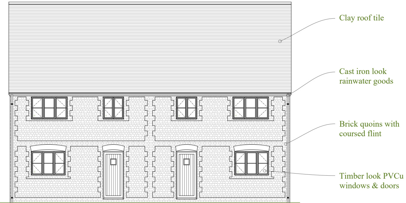
North 1:100 | PROPOSED