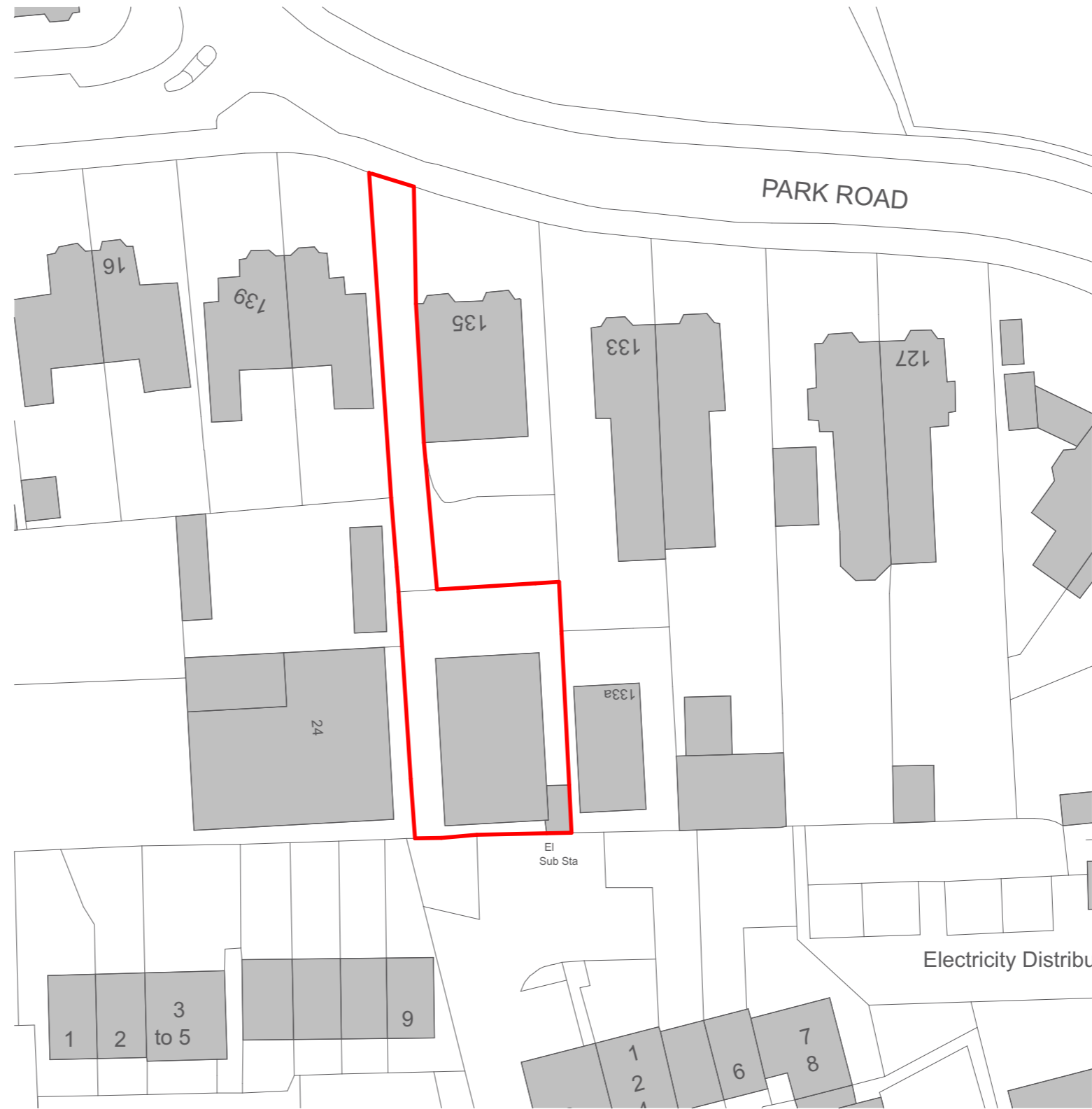
Proposed Block Plan Scale 1:500