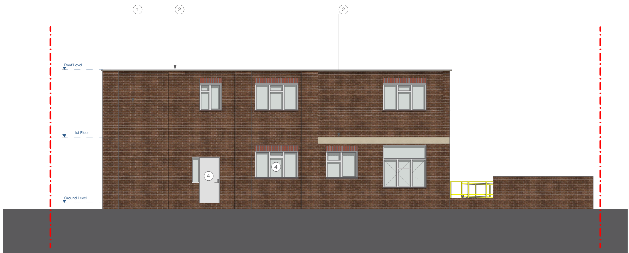
01 - EXISTING EAST ELEVATION

job no date drawing no. revision HA104 25.02.2026 070 P.A