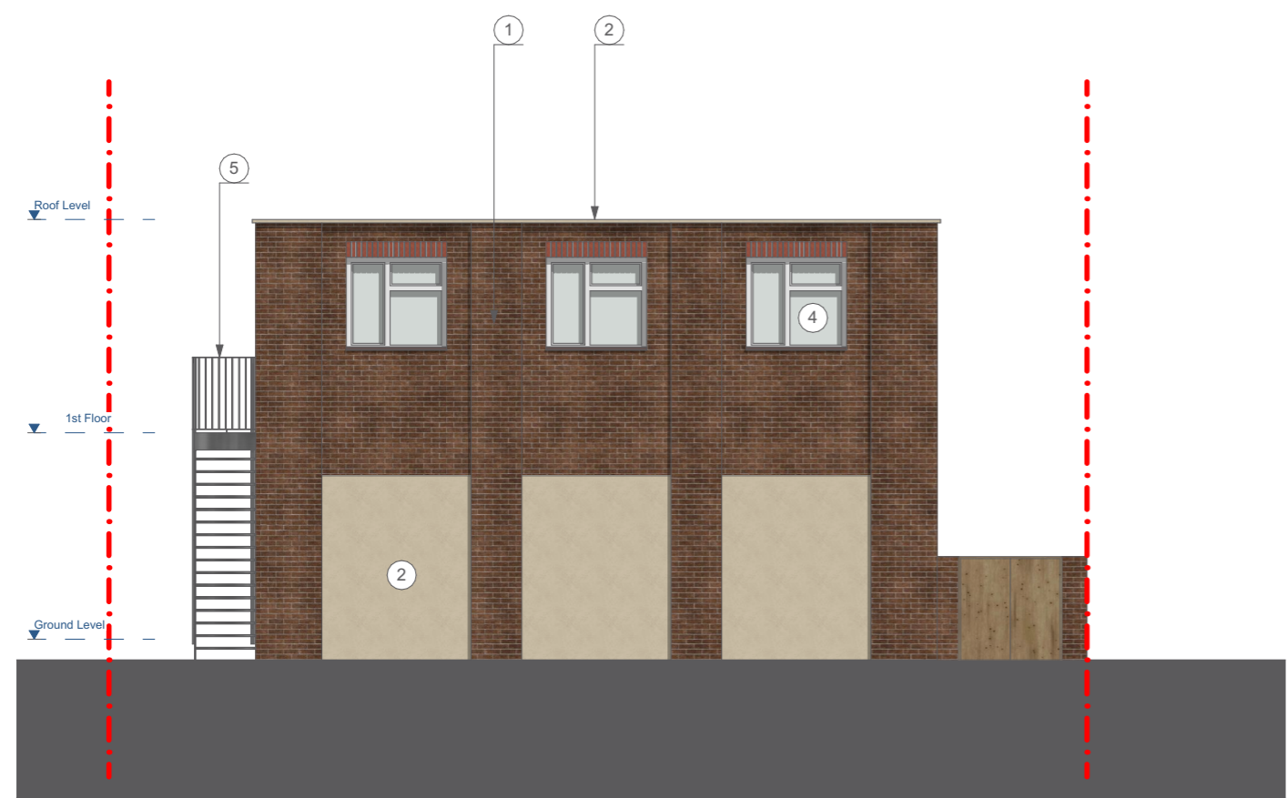
01 - EXISTING SOUTH ELEVATION

job no date drawing no. revision HA104 25.02.2026 071 P.A