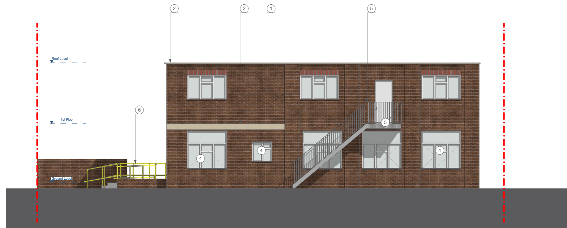
01 - EXISTING WEST ELEVATION

job no date drawing no. revision HA104 25.02.2026 072 P.A