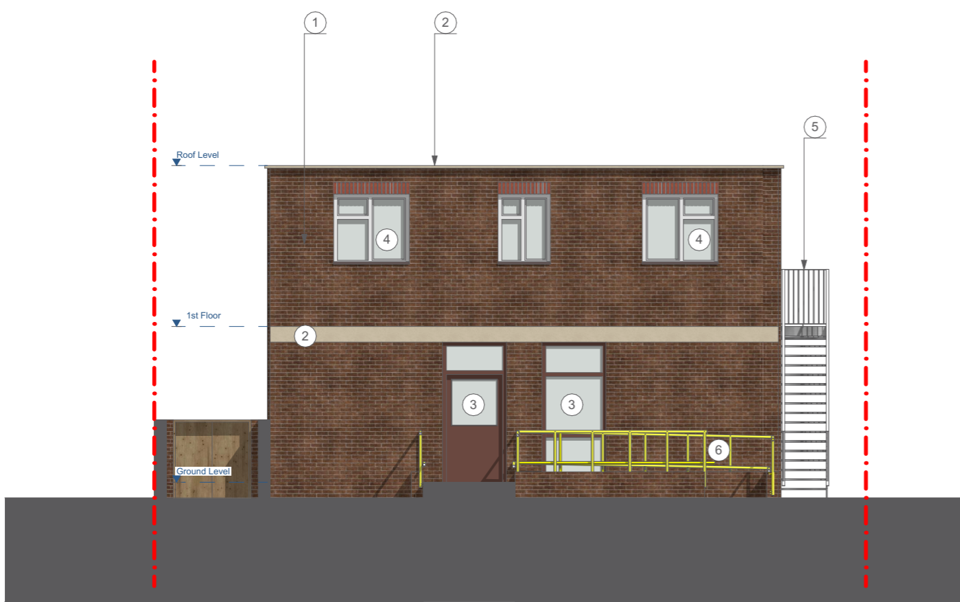
01 - EXISTING NORTH ELEVATION

job no date drawing no. revision HA104 25.02.2026 073 P.A