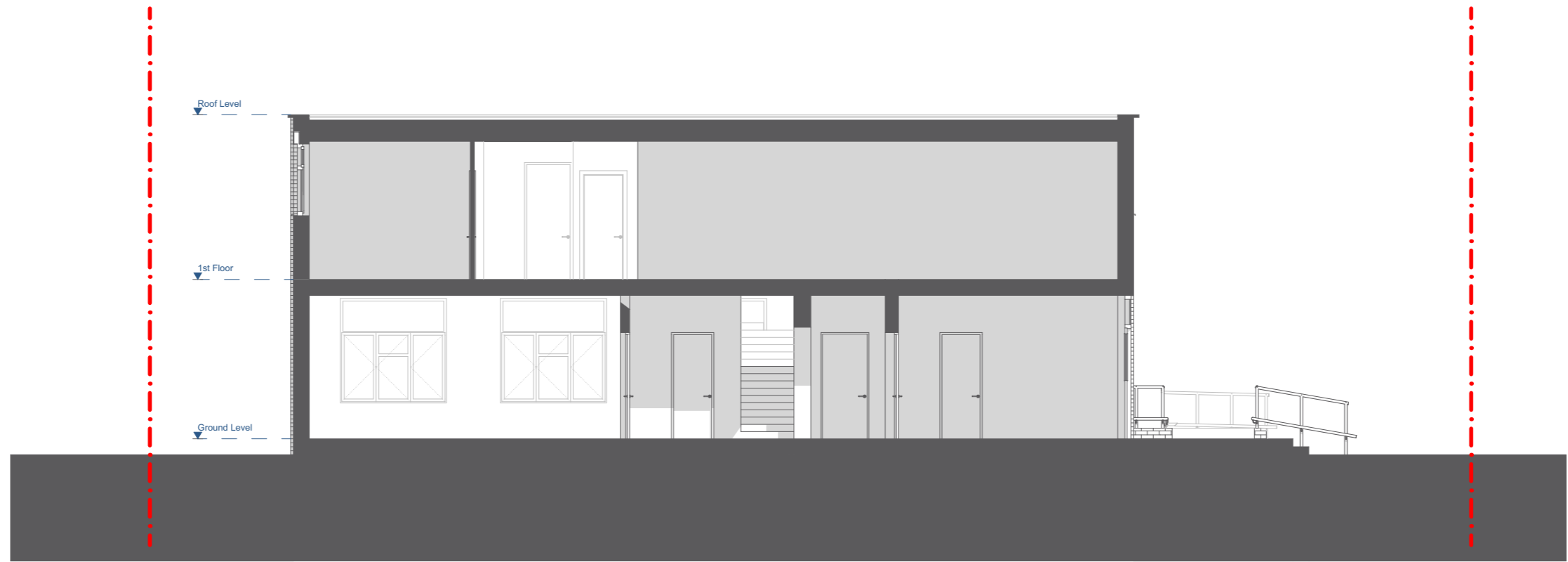
01 - PROPOSED B-B SECTION