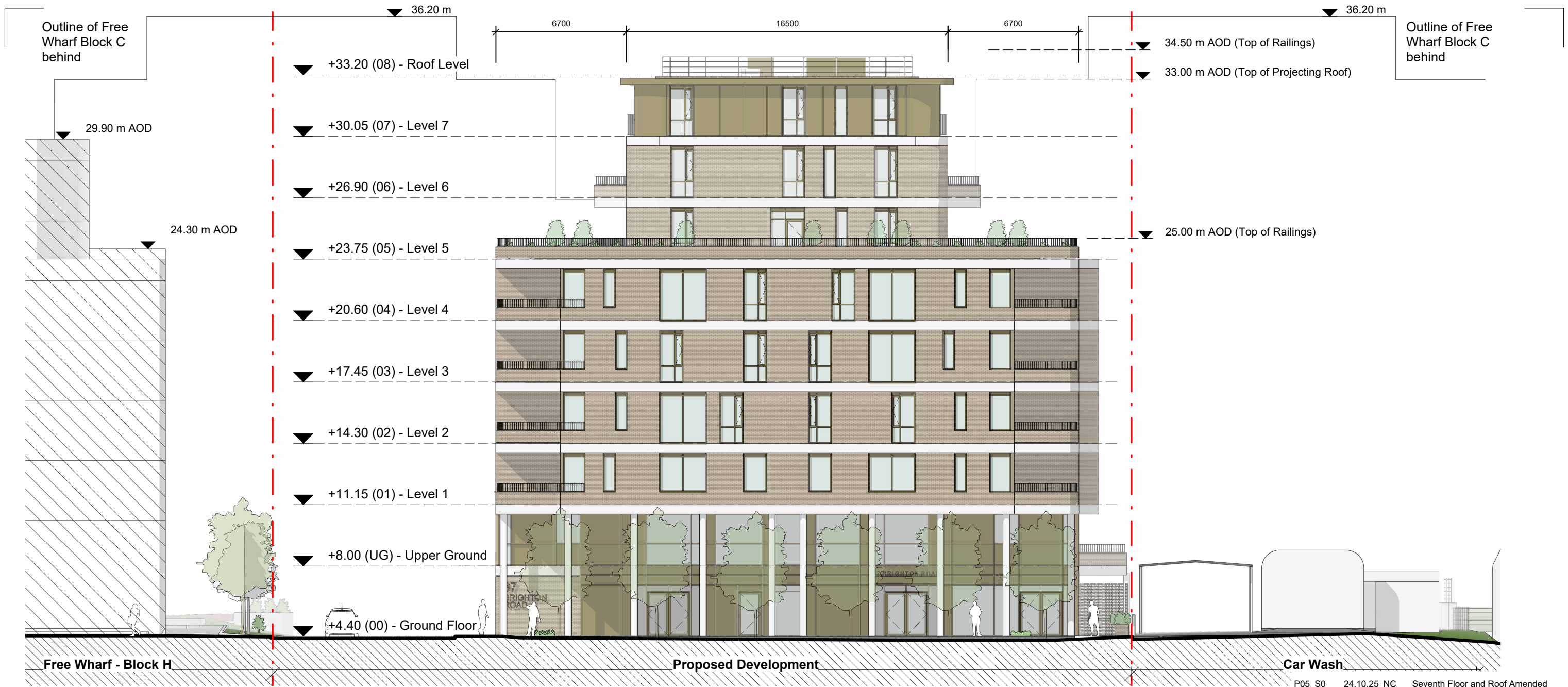
1 Proposed North Elevation 1 : 200