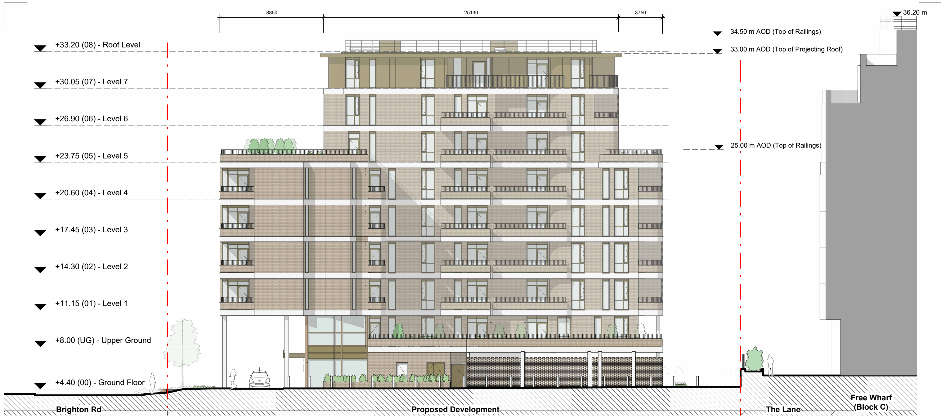
1 Proposed West Elevation 1 : 200