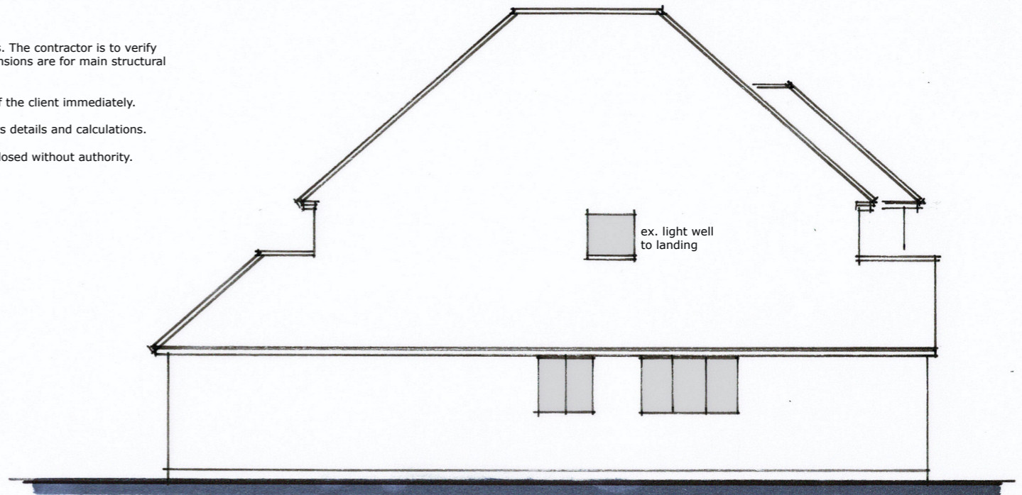
SIDE (s) ELEVATION 1:100 @ A3 / 1:50 @ A1