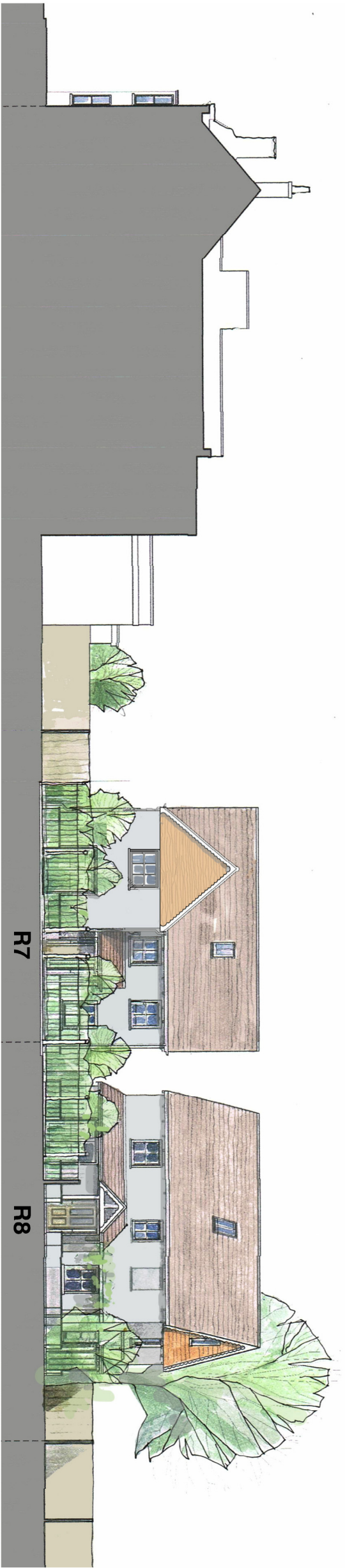
Proposed contextual street elevation / section DD Scale 1:200@A3 See drawing TA 1552 - 10 & 11 for section reference