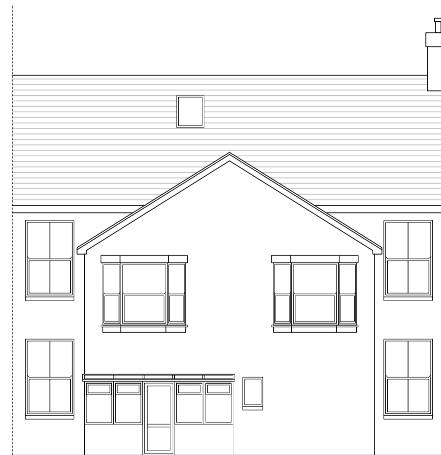
Existing Rear Elevation 1:100