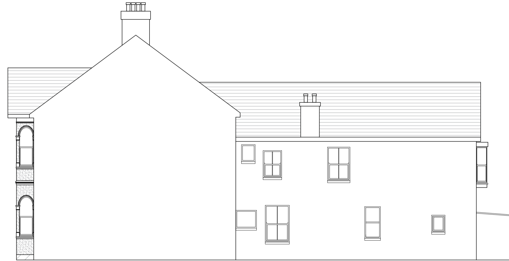
Existing Side Elevation 1:100