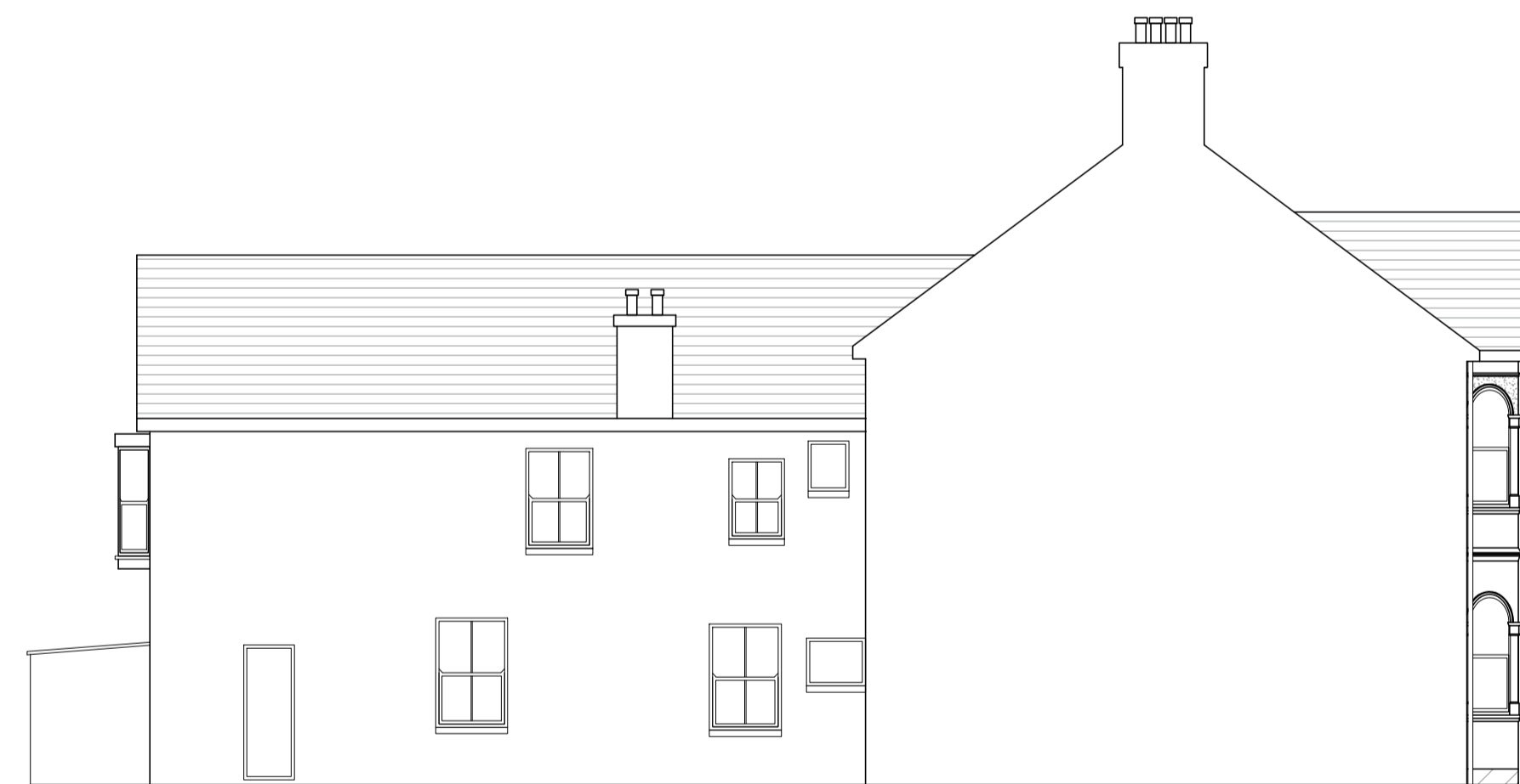
Existing Side Elevation 1:100