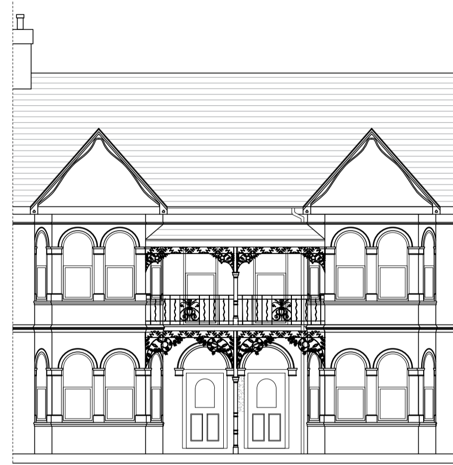
Existing Front Elevation 1:100