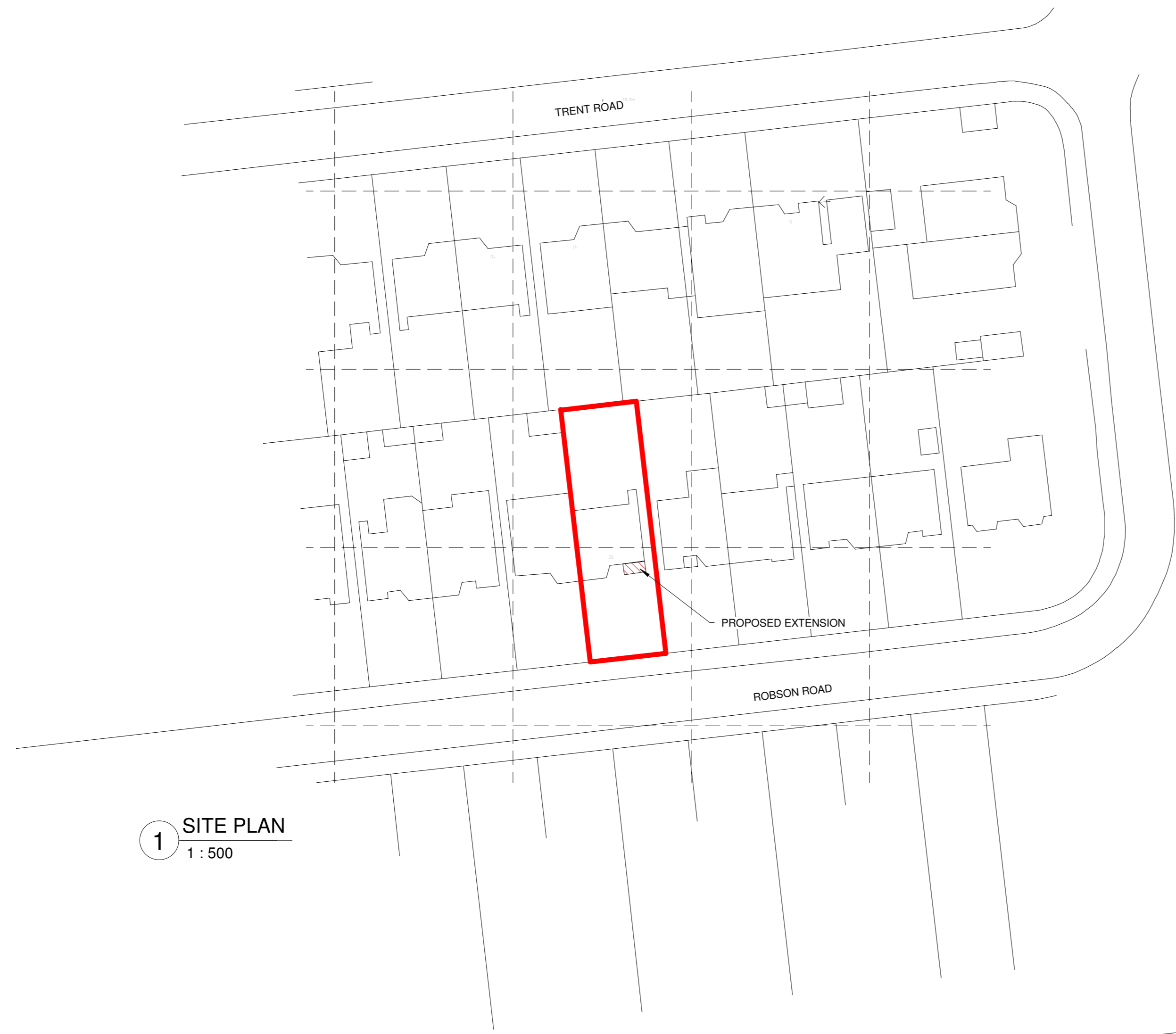
1 SITE PLAN 1 : 500