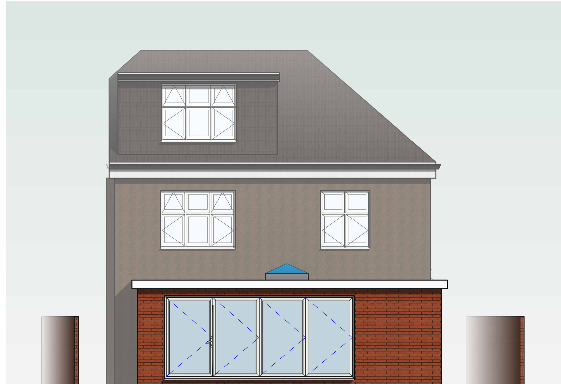
Proposed Rear Elevation (West)