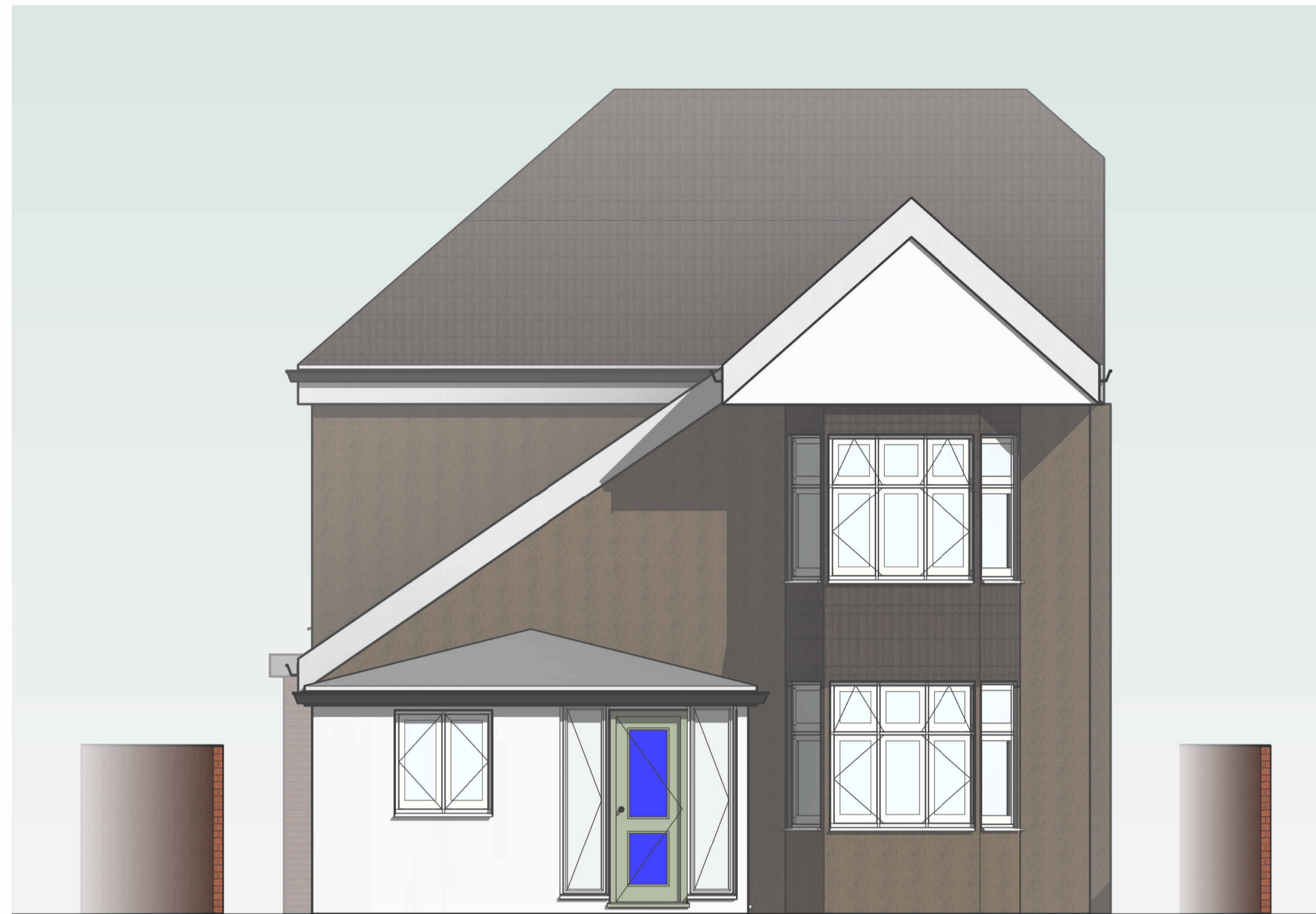
Proposed Front Elevation (East)

3. THIS DRAWING IS TO BE READ IN CONJUNCTION WITH ALL RELEVANT ARCHITECT'S, SERVICE ENGINEER'S AND ARCHEVOLVE AND SPECIFICATIONS.