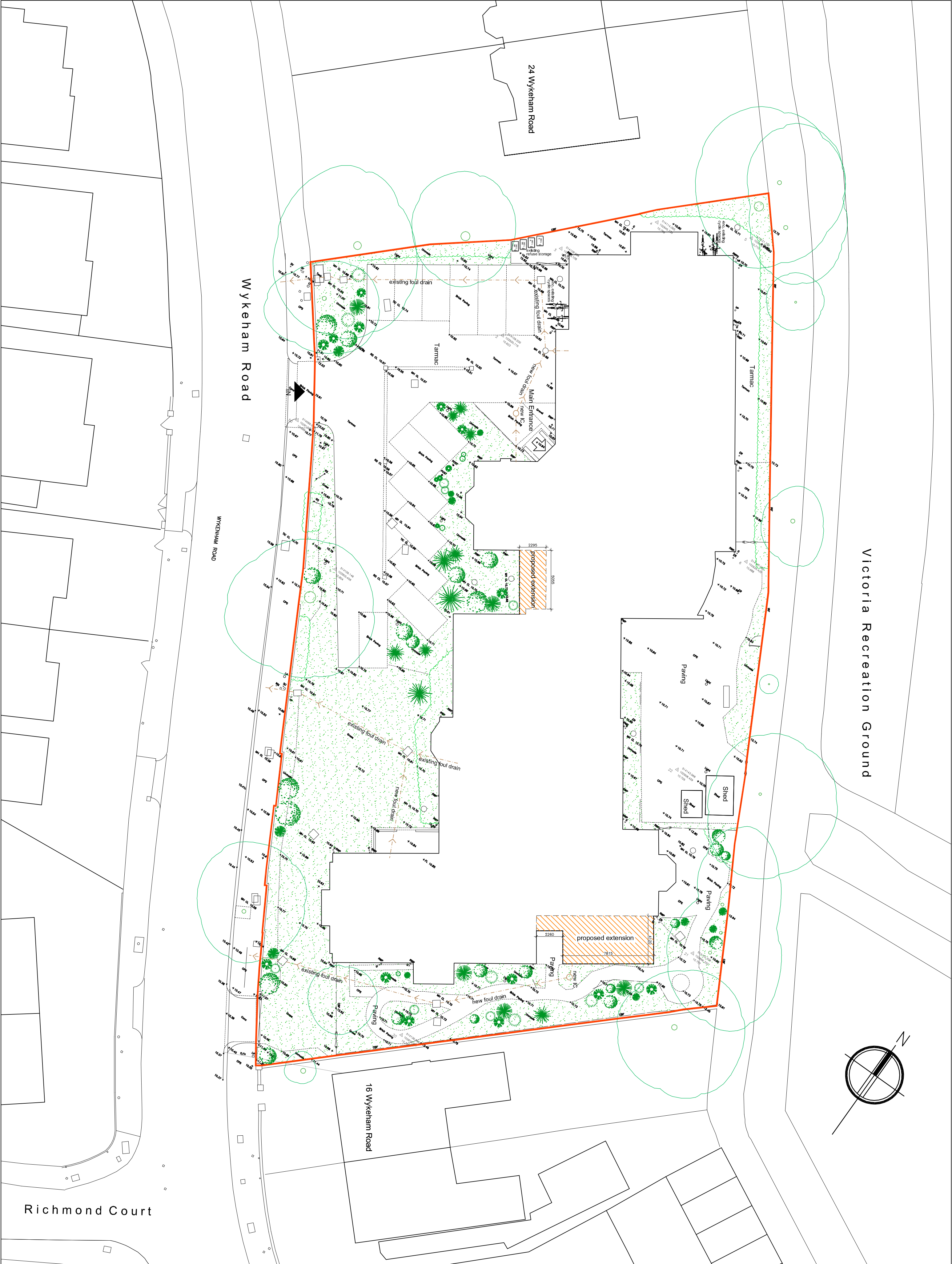
1:200 Site Plan as Proposed