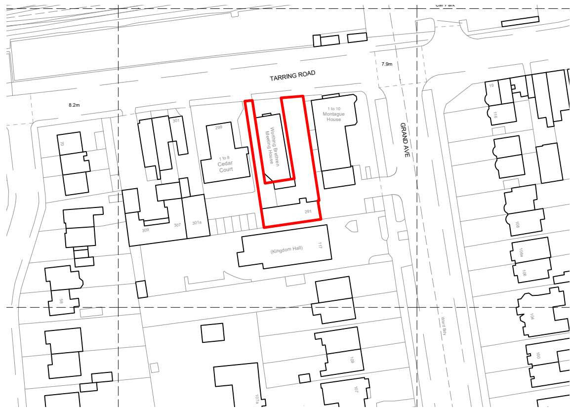
Location plan 1:1250 @ A3