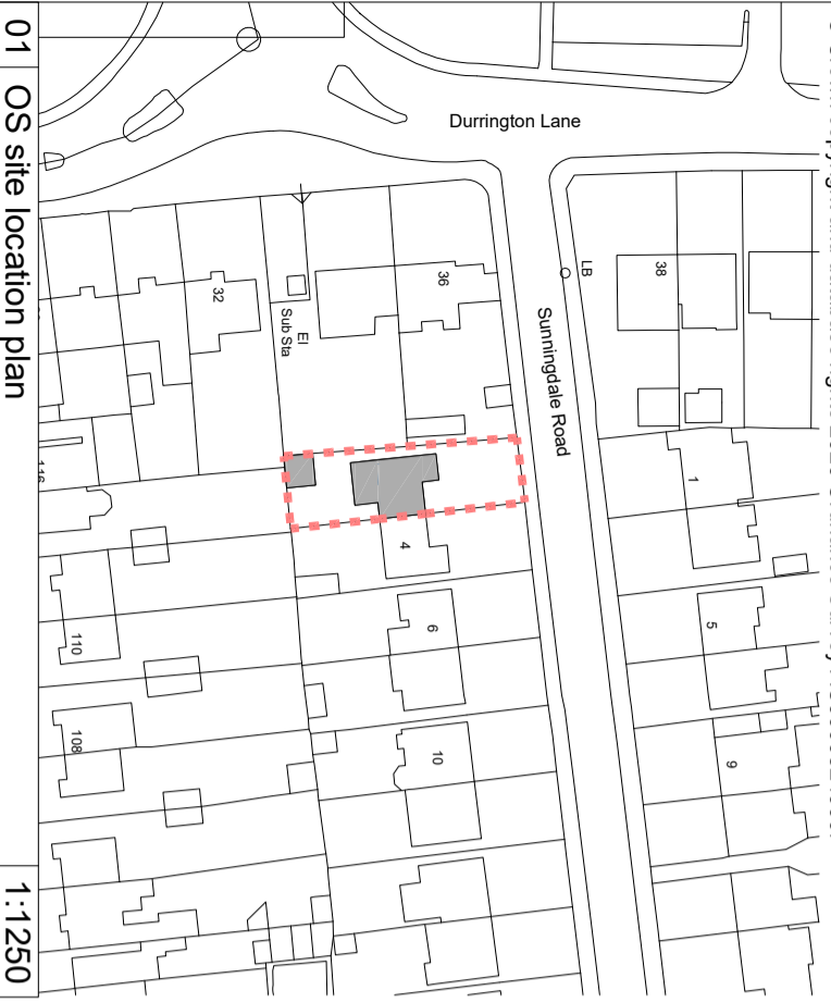
01 OS site location plan 1:1250