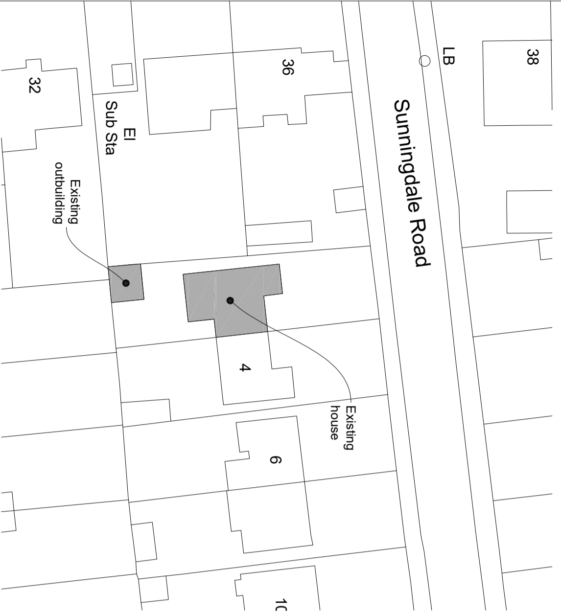
02 Existing block plan 1:500

PLEASE NOTE: THIS DOCUMENT IS THE PROPERTY OF ARCHITECTS AND SHOULD NOT BE REPRODUCED OR TRANSMITTED IN ANY FORM OR BY ANY MEANS, ELECTRONIC OR MECHANICAL, INCLUDING PHOTOCOPYING, RECORDING, OR BY ANY INFORMATION STORAGE AND RETRIEVAL SYSTEM, WITHOUT THE WRITTEN PERMISSION FROM STUDIO 15 ARCHITECTS.