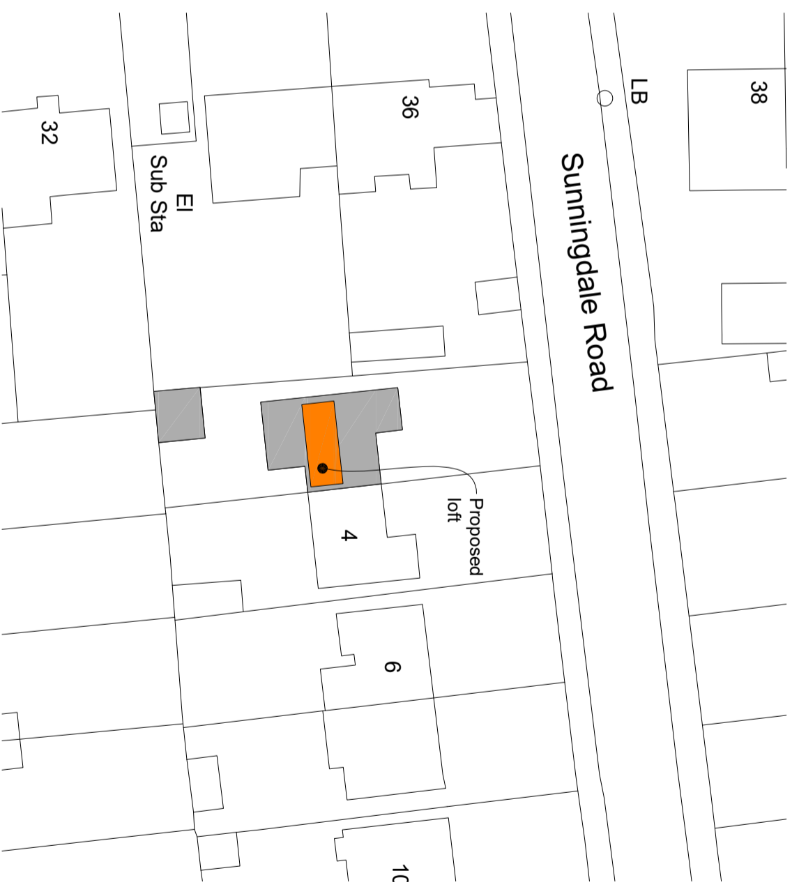
03 Proposed block plan 1:500