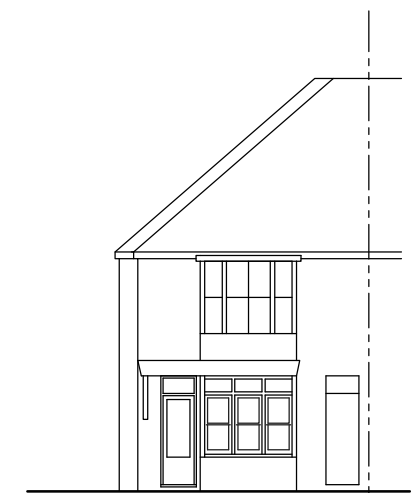
Front (East) Elevation @ 1:100