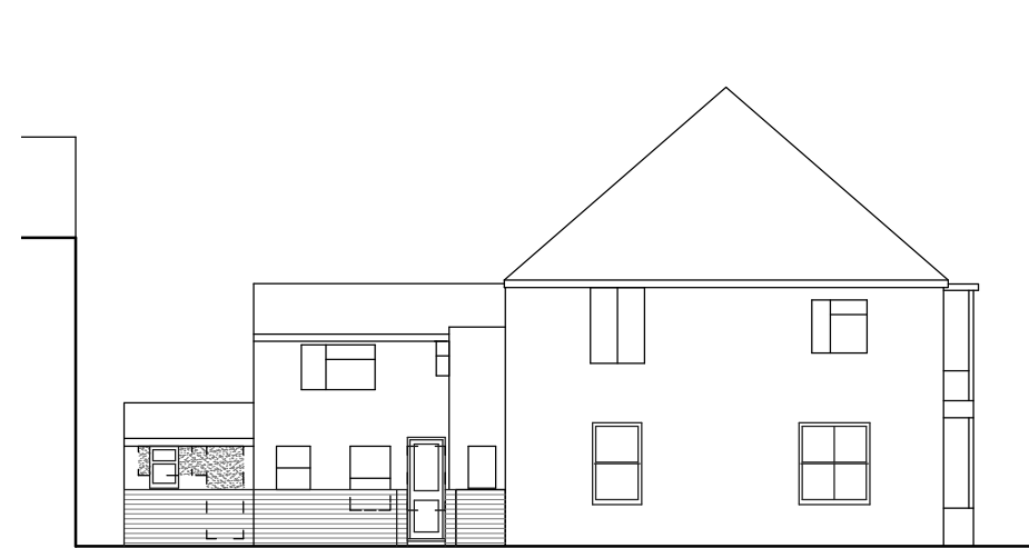
Side (South) Elevation @ 1:100