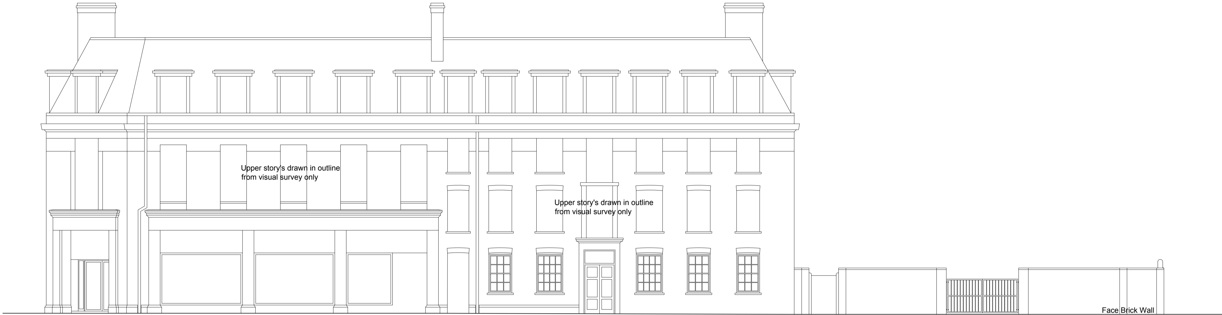
Side Elevation (North) 1:100