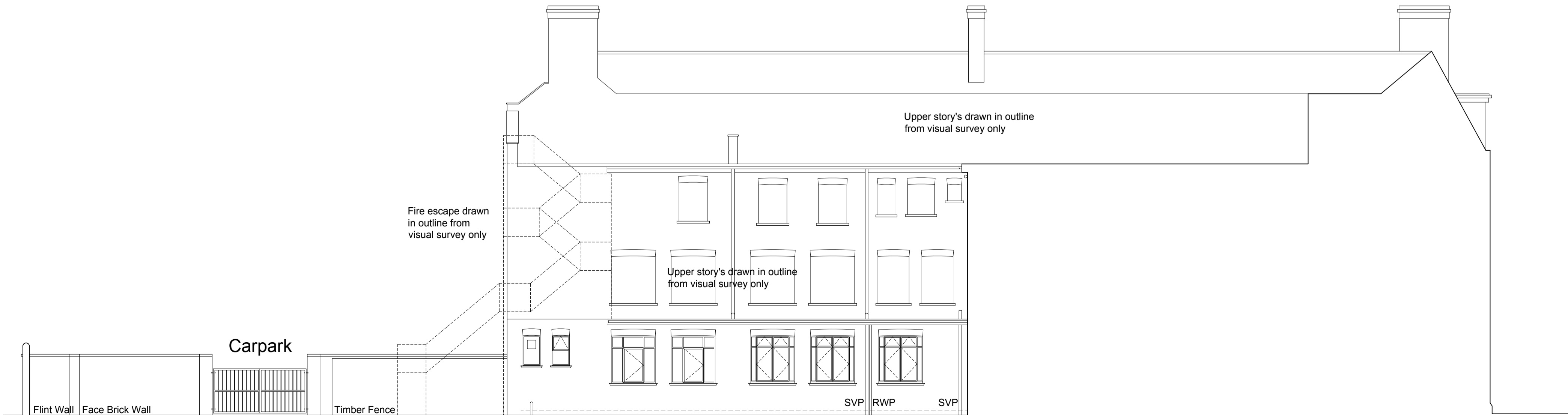
Side Elevation (South) 1:100