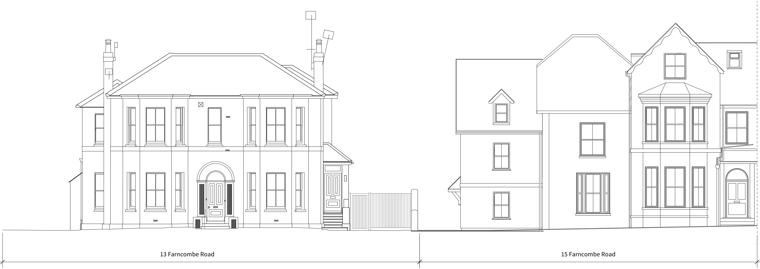
Existing street elevation 1:100 @A3

23 Vine Street, Brighton BN1 4AG e: studio@sticklandwright.co.uk t: 01273 964051 Company registered in England No. 11222477