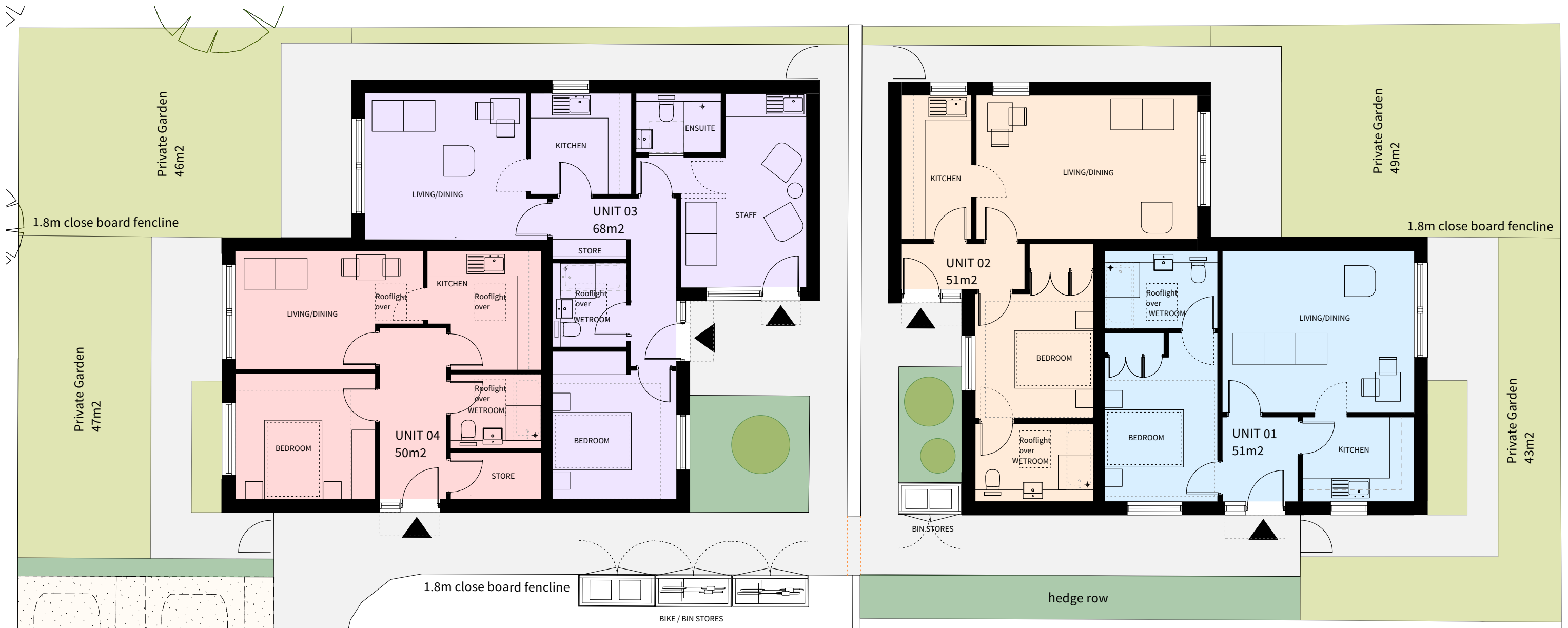
Ground Floor Plan 1:100 @A3

23 Vine Street, Brighton BN1 4AG e: studio@sticklandwright.co.uk t: 01273 964051 Company registered in England No. 11222477