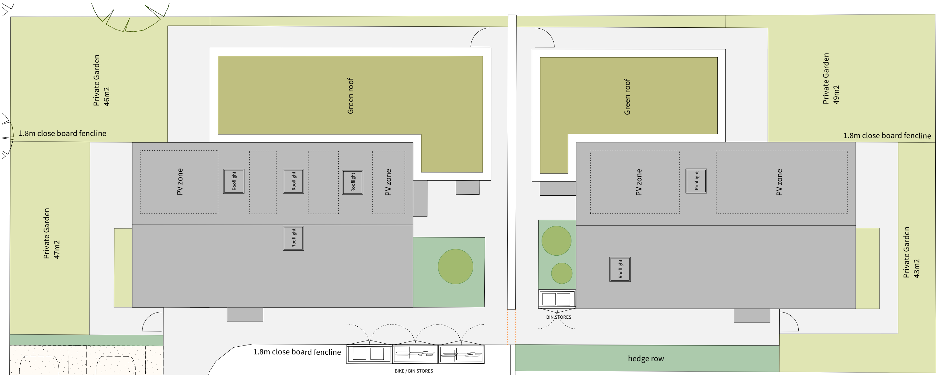
Proposed Roof Plan 1:100 @A3

23 Vine Street, Brighton BN1 4AG e: studio@sticklandwright.co.uk t: 01273 964051 Company registered in England No. 11222477