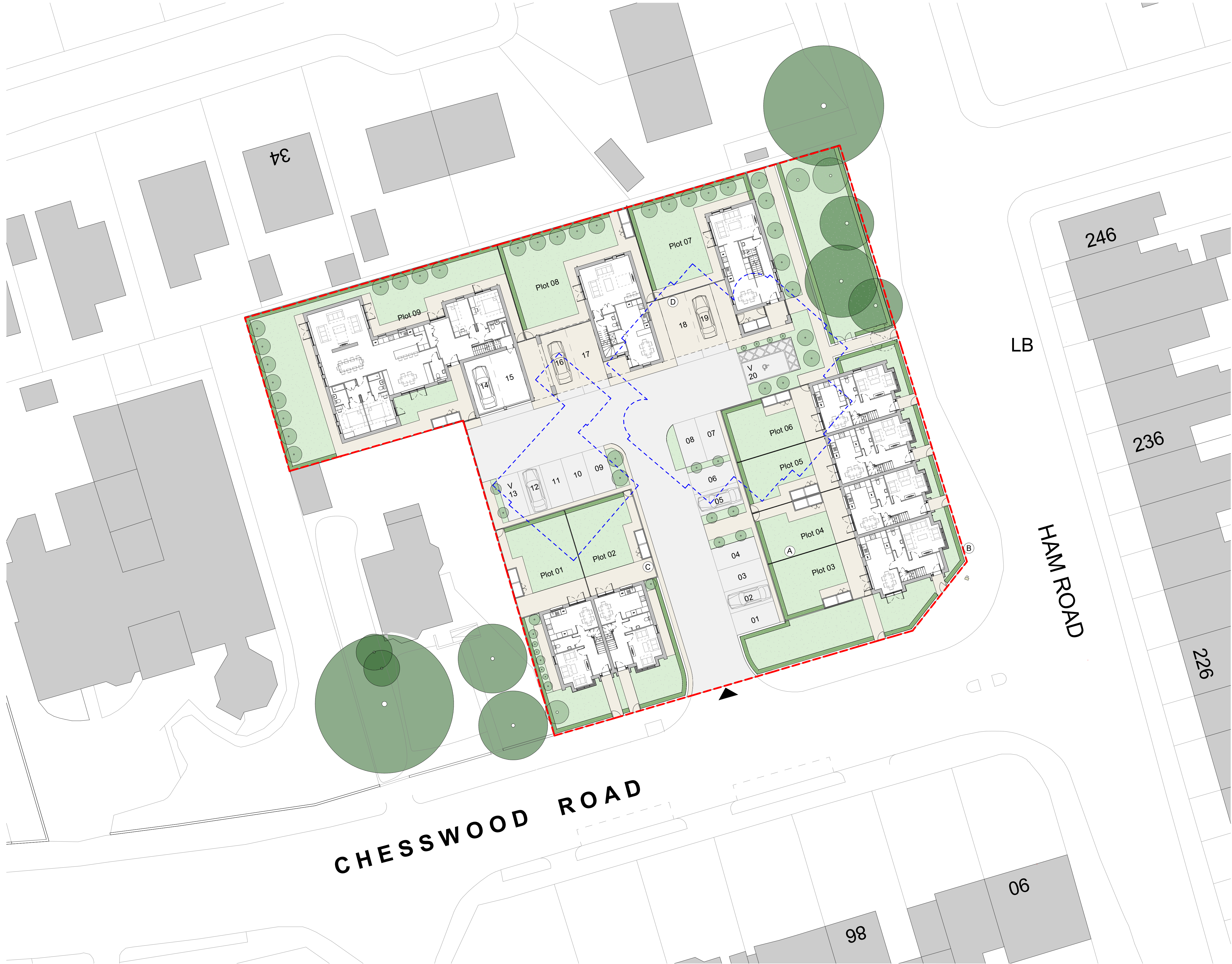
Proposed Site Plan 1 : 200