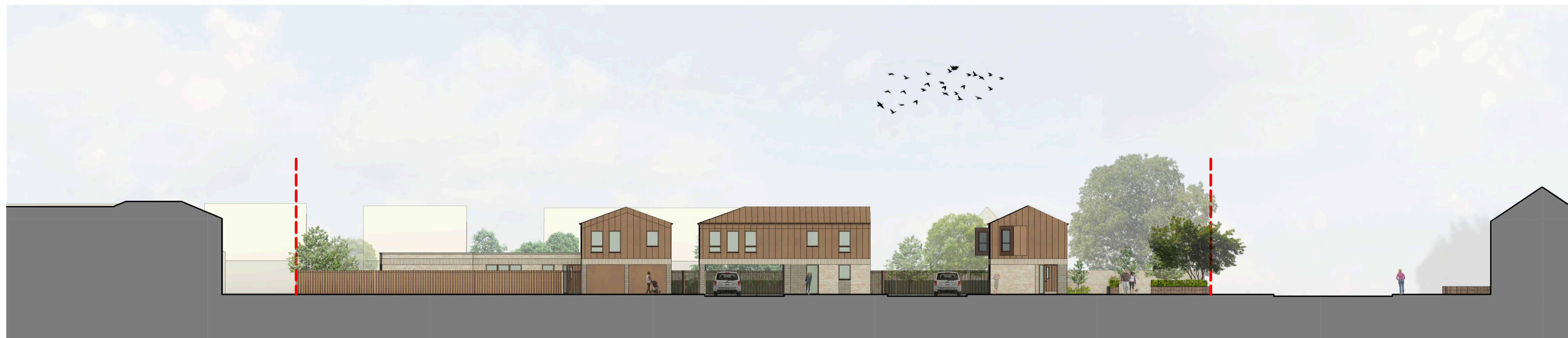
Street Scene 3 - House Type 4-6 1 : 200