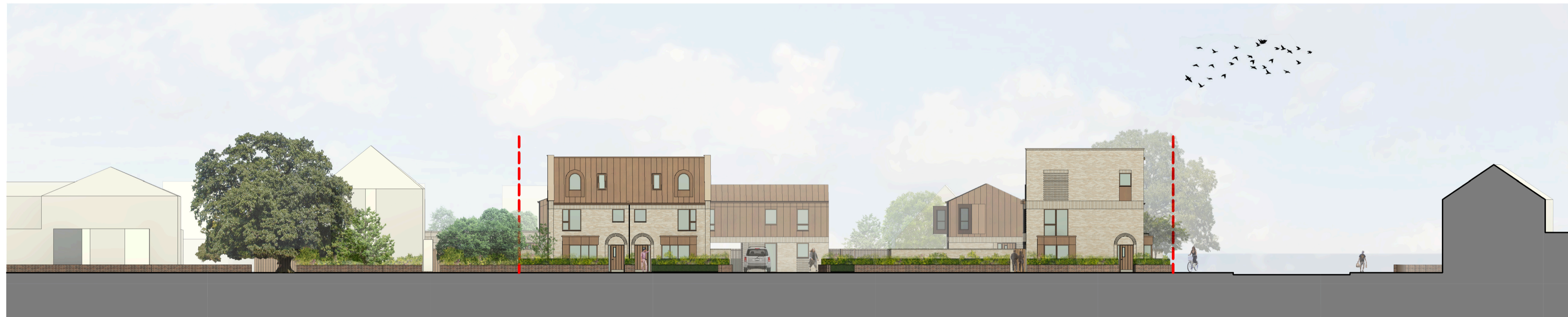
Street Scene 2 - Chesswood Road 1 : 200