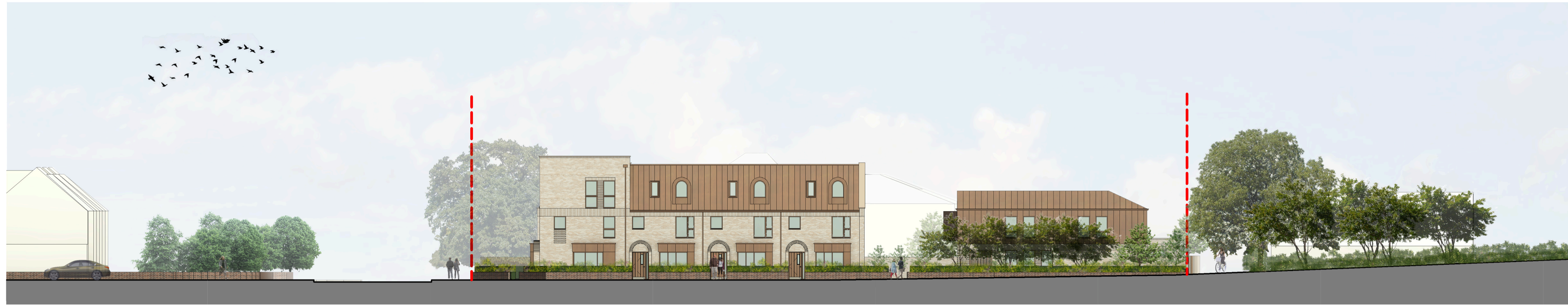
Street Scene 1 - Ham Road 1 : 200