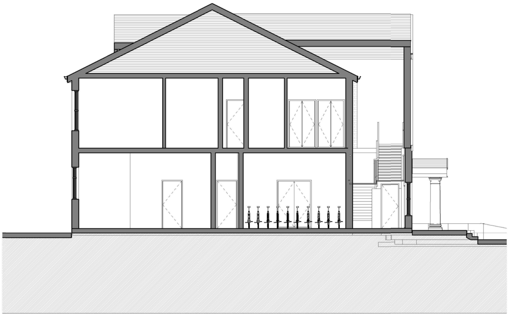
Section 2 1 : 100