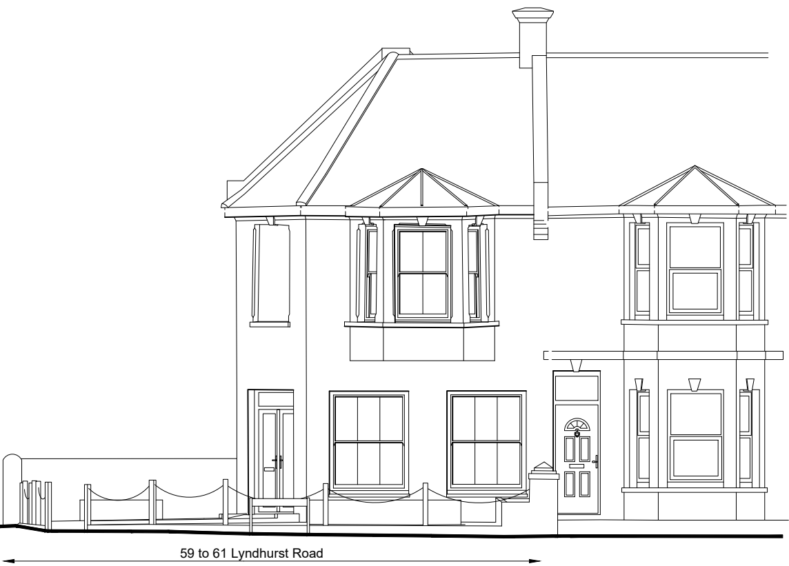
PARK ROAD ELEVATION (east) 1:100

Existing and Proposed Elevations No changes 1:100