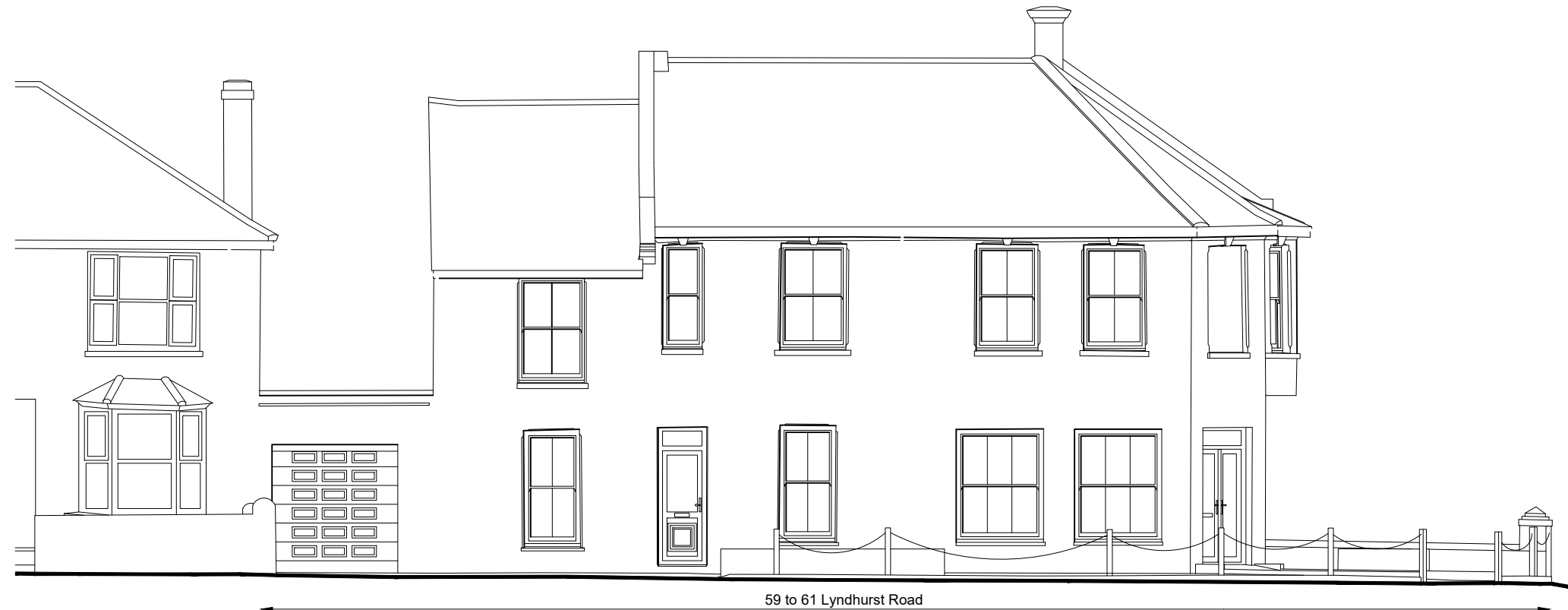
LYNDHURST ROAD ELEVATION (south) 1:100