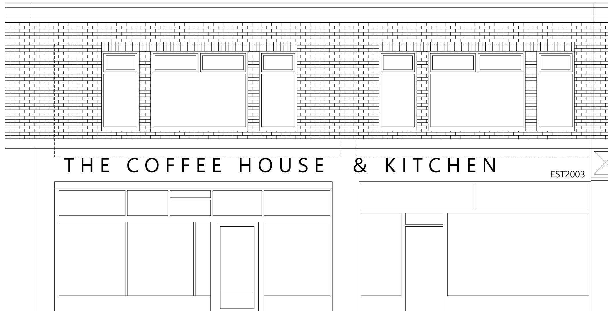
Front Elevation - North-west facing