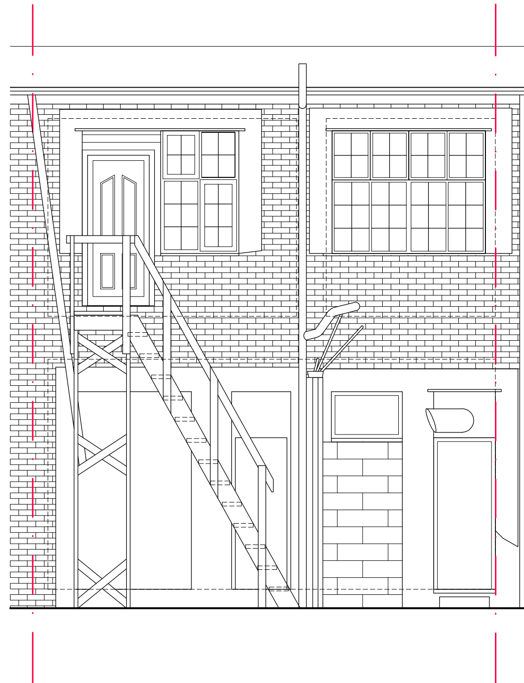
Rear Elevation - South-east facing