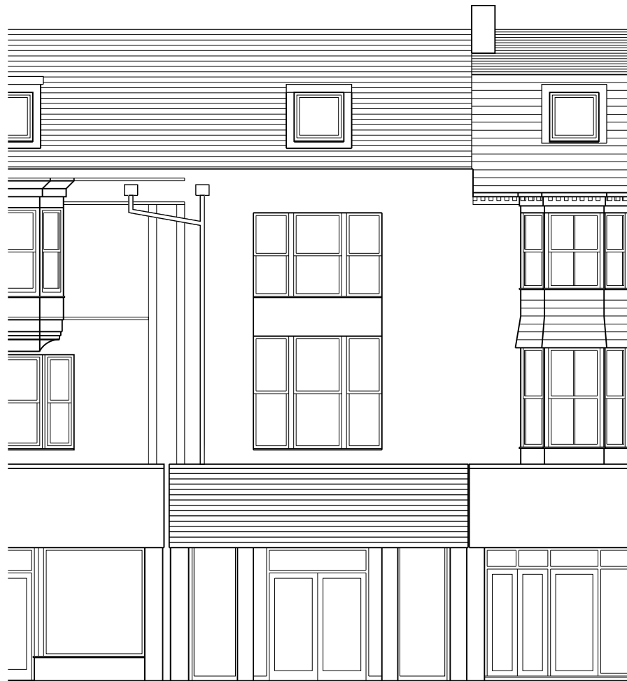
Southern Elevation Western Elevation

9 Warwick Street 11 Warwick Street 13 Warwick Street