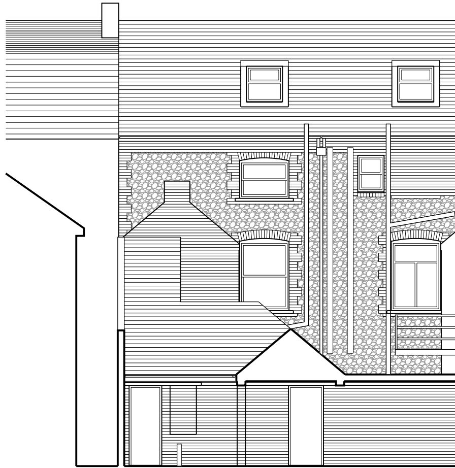
Northern Elevation Eastern Elevation