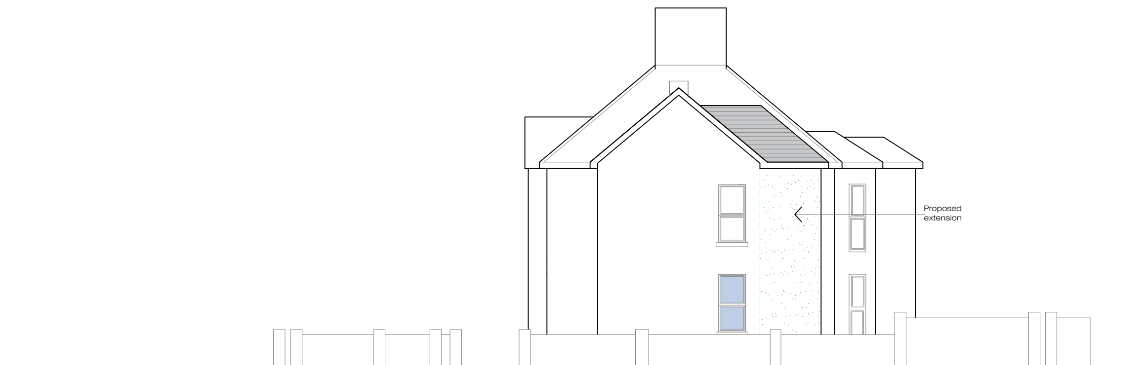
PROPOSED SIDE ELEVATION - NORTH

DVD Building Design Flat E2 Belvedere 152-158 Dyke Road Brighton BN1 5PA