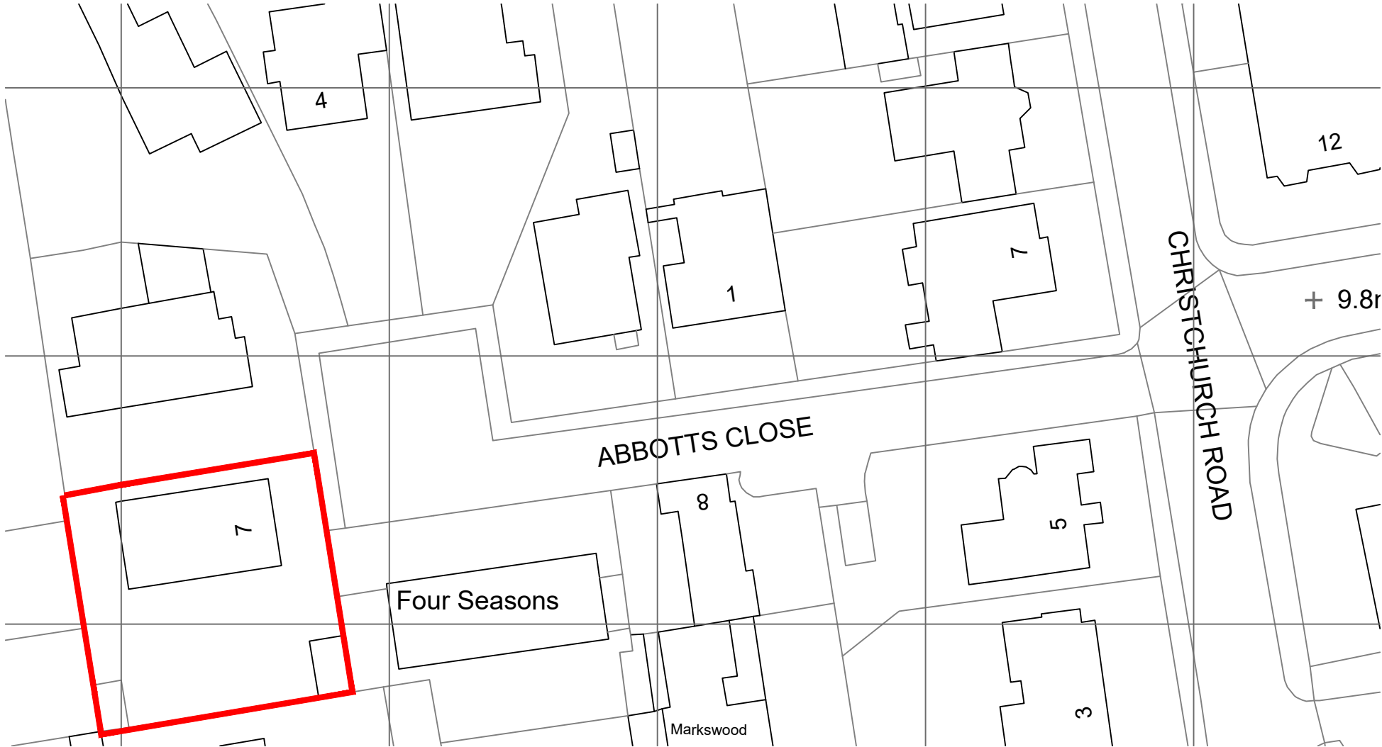
BLOCK PLAN 1:500 @ A3