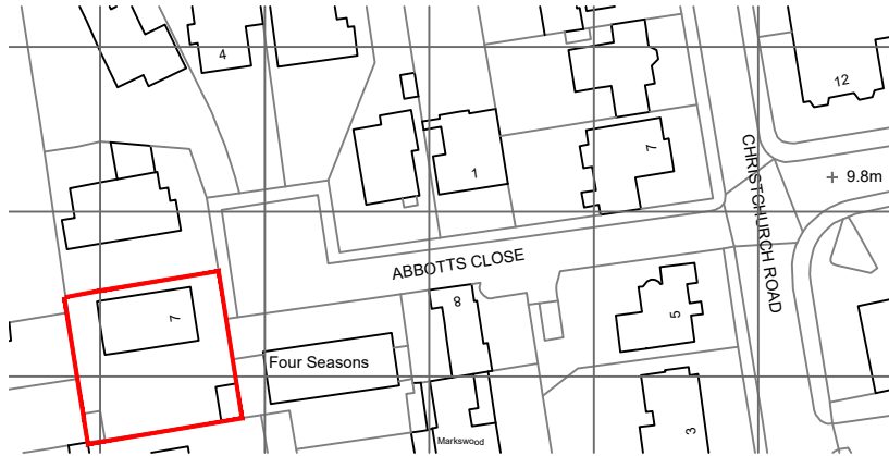
SITE LOCATION PLAN 1:1250 @ A3