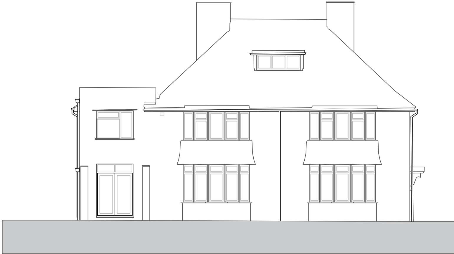
EXISTING SOUTH ELEVATION 1:100 @ A3