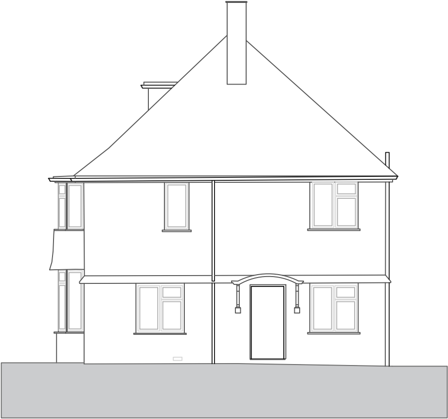
EXISTING EAST ELEVATION 1:100 @ A3