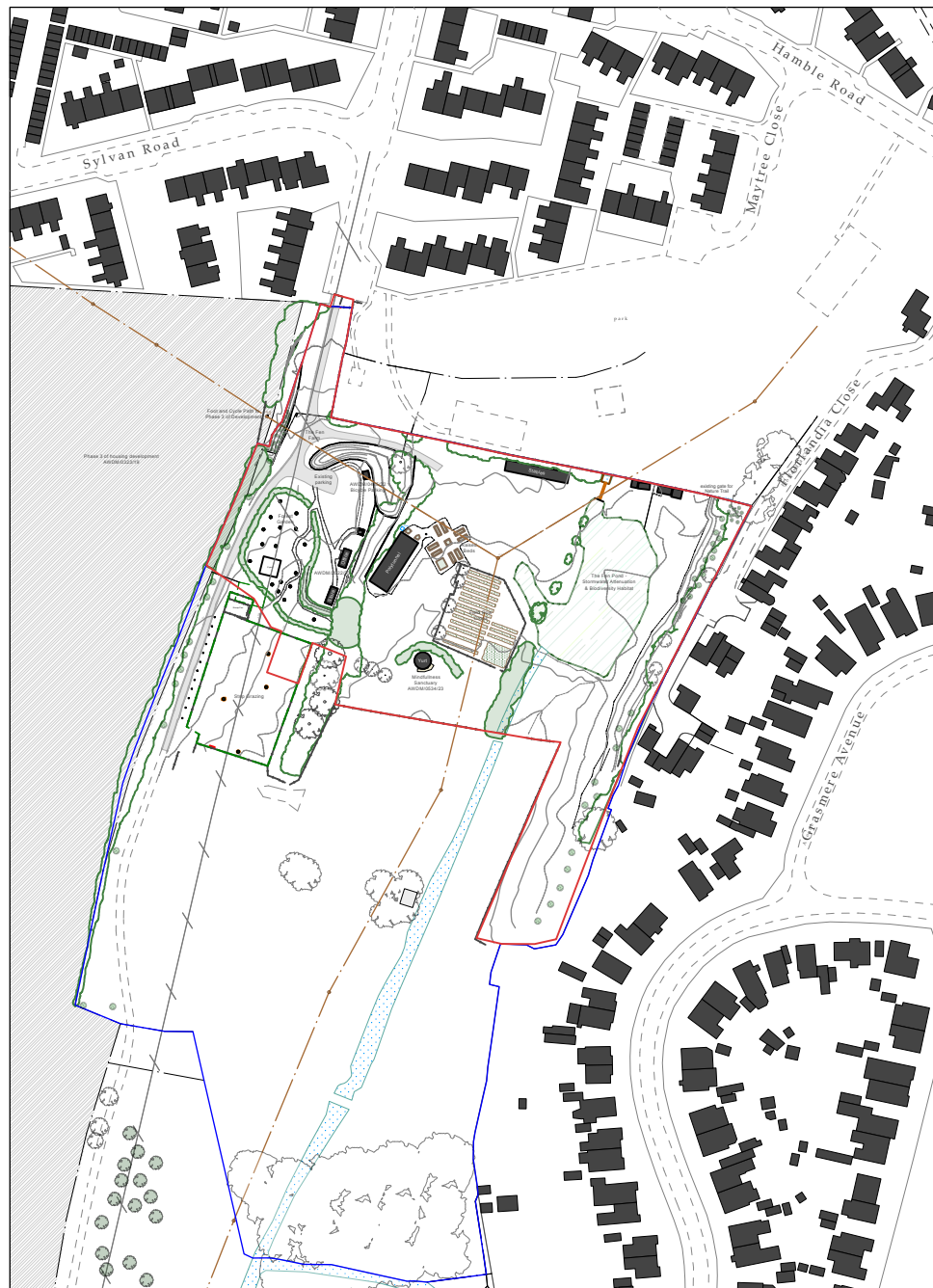
Existing location plan