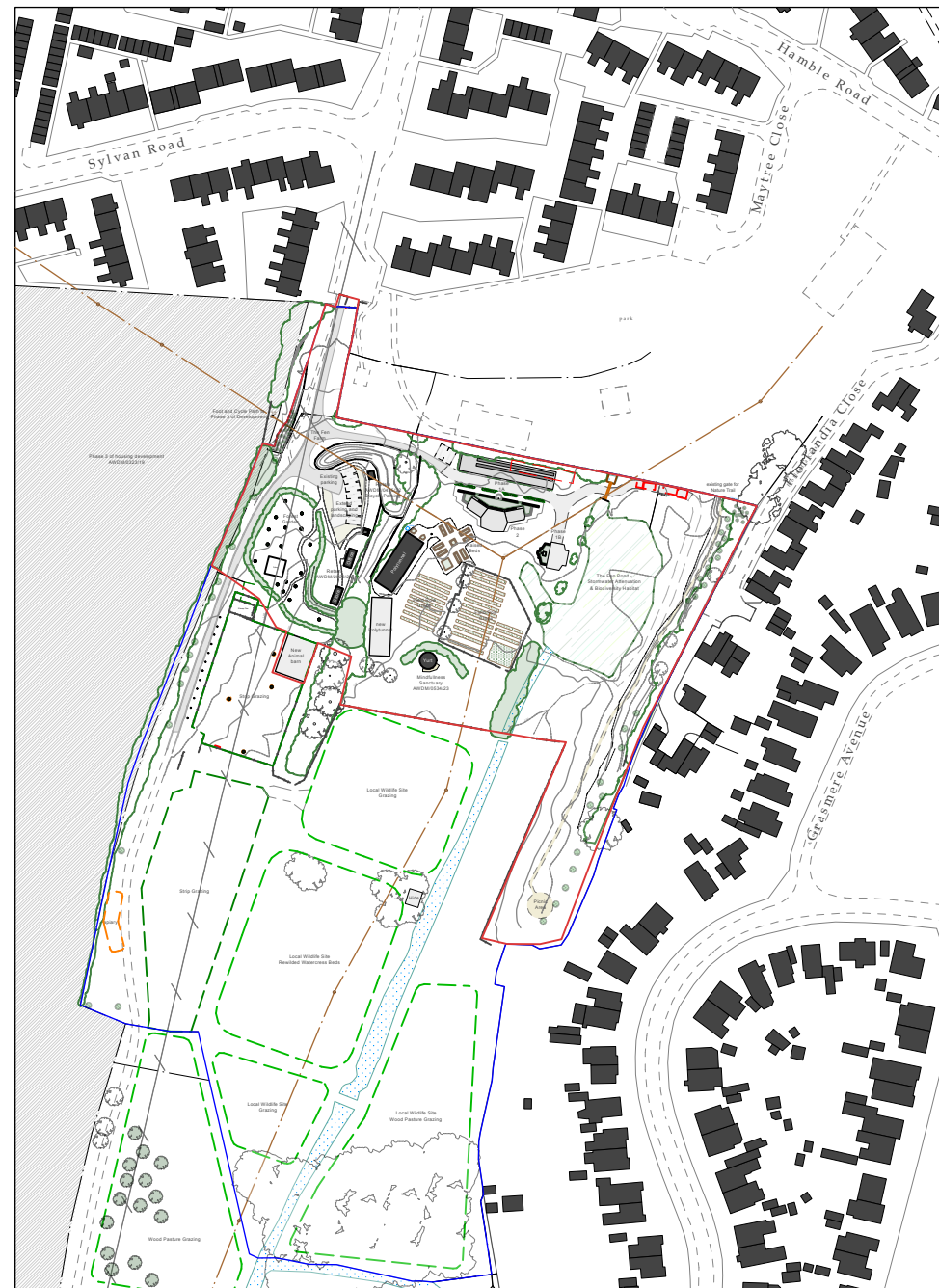
Proposed location plan