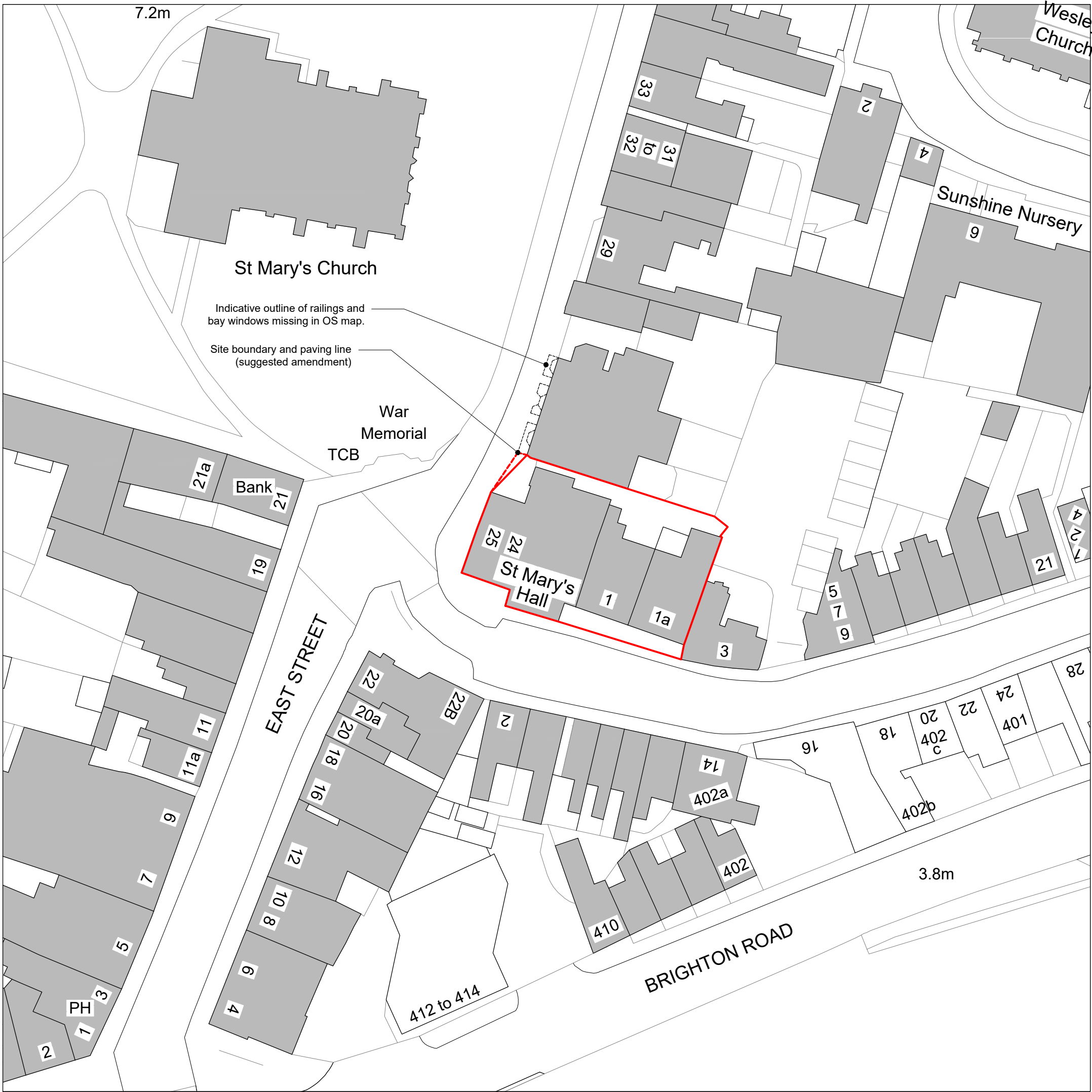
2 Existing Block Plan 1:500