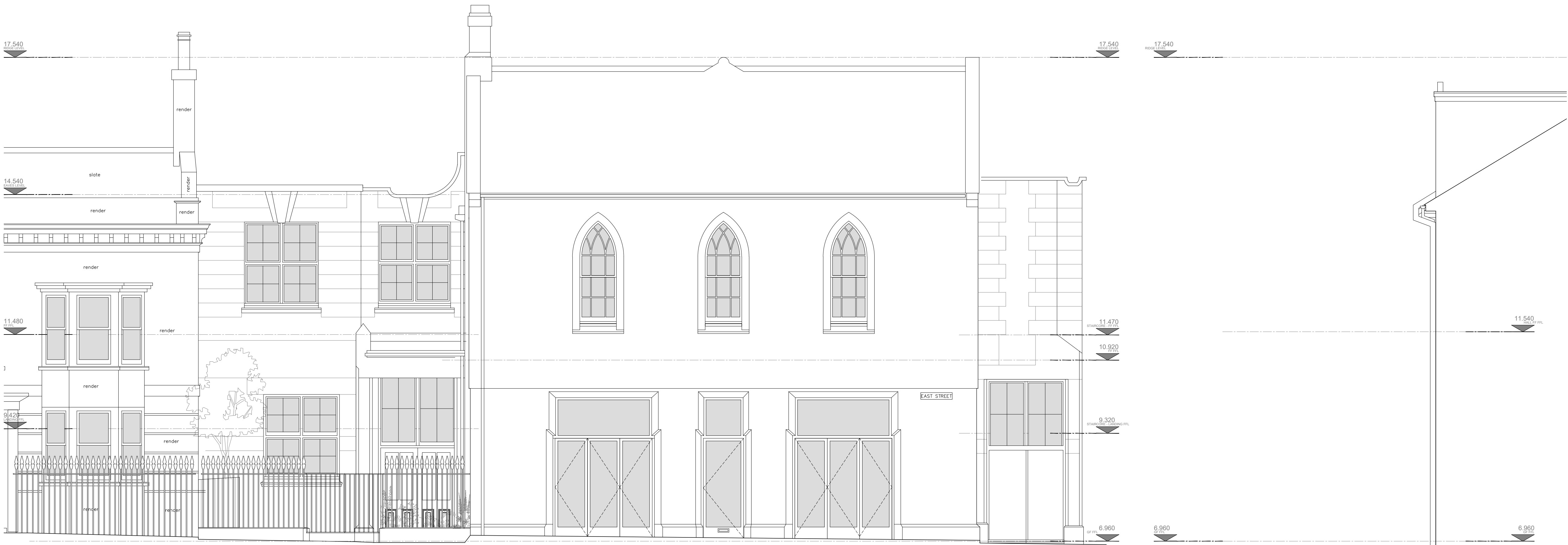
2 Proposed North West Elevation 1:50