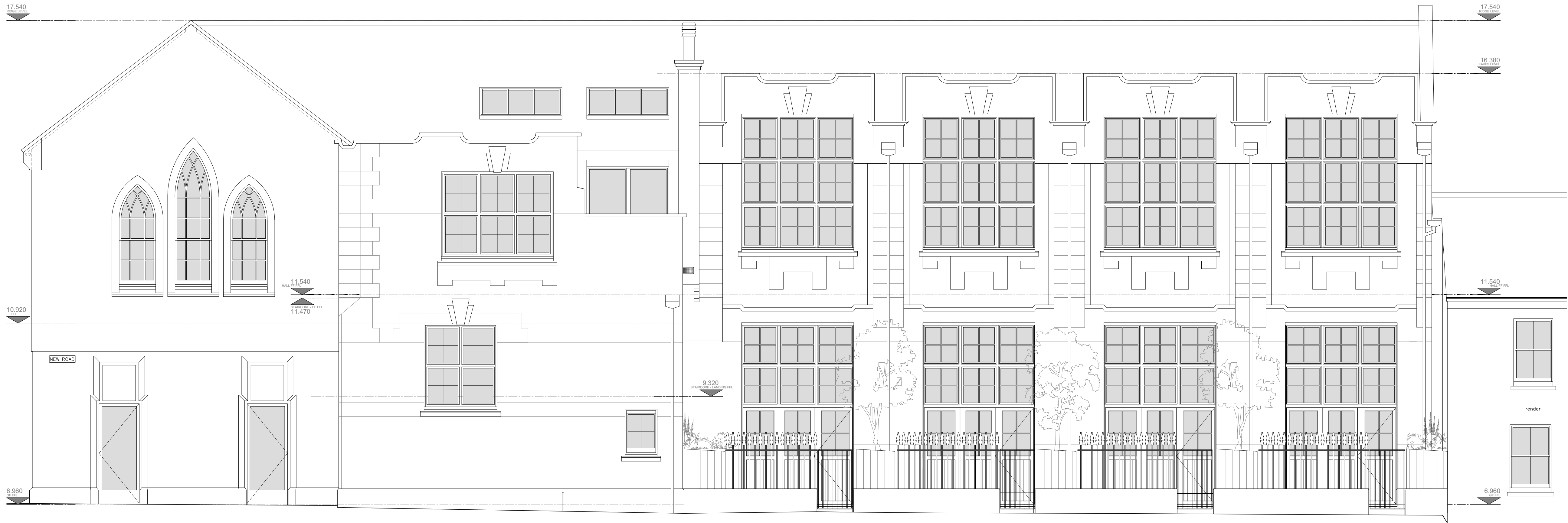
1 Proposed South West Elevation 1:50 Scale in metres