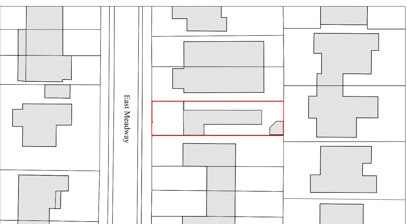
EXISTING BLOCK PLAN 1:500

Red line indicated Application Site Boundary